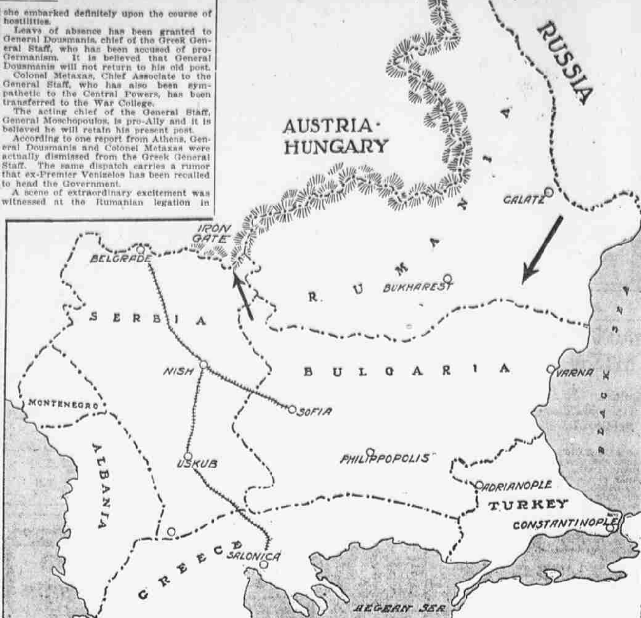
Rumania's geographical situation, as shown in the accompanying map of the Balkan nationas, makes her entry into the wr at this time highly important. Her army of 600,000 men can be utilized, either against Austria by way of the Iron Gate, or by direct offensive against Bulgaria from the Danube.

Rumania joined the Entente Allies. When special editions of the newspapers appeared with the news the large crowds gathered and parades through many streets took