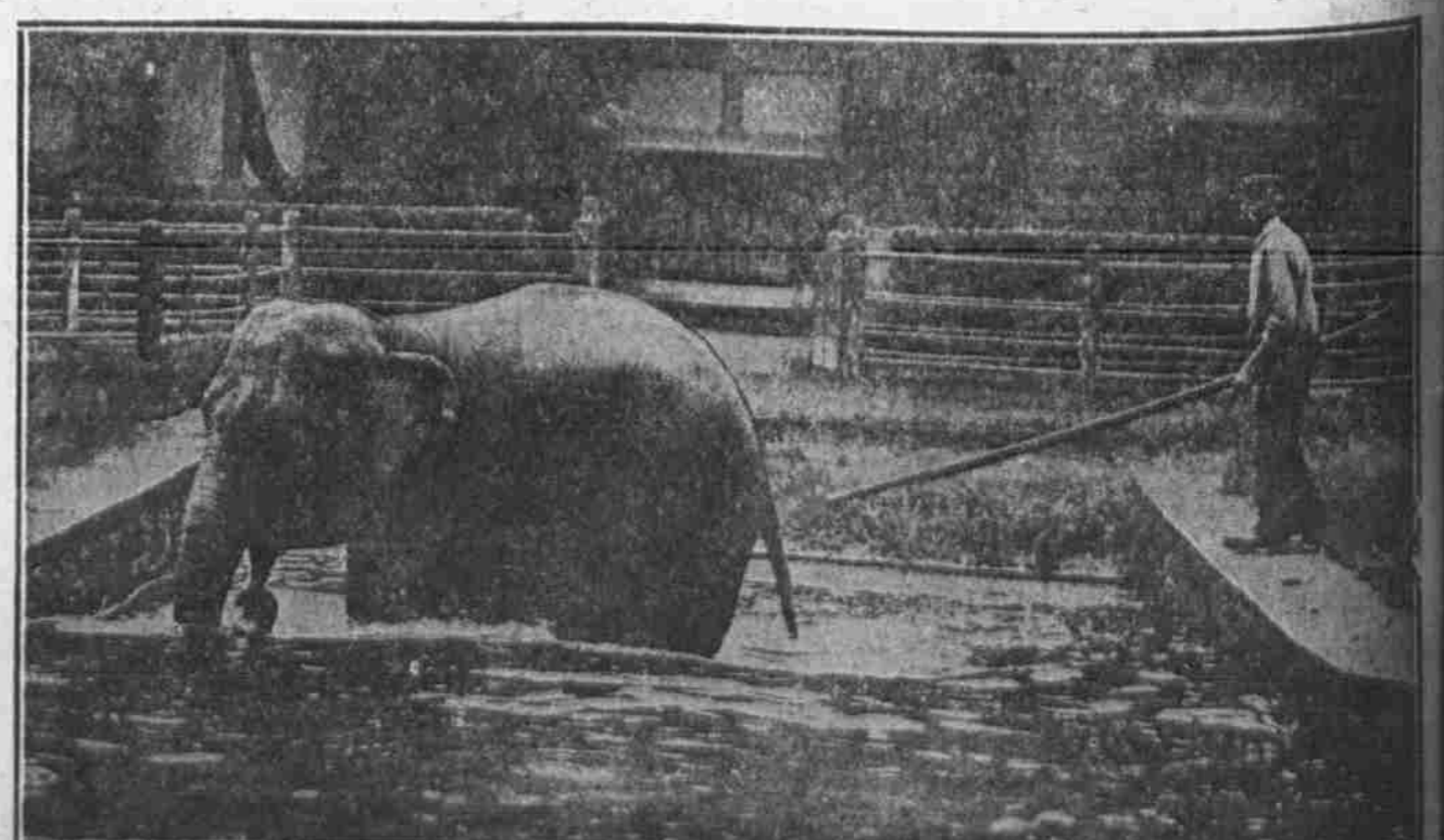
"KAISERIN," ZOO'S BIG ELEPHANT, TAKES A COOLING BATH IN THE HIPPO POOL

VO GE VA W Fle C COM Joffr and SLAV War 1 ture and have the P is pr Comb much ish ar 2 Germ to ab territ they ficti Greek Mace vance confir the R the R for throug 3. taken sector from the R checke 4. from Petro the R regime the Tu Attemp Maurepa an the by the R in its co French the posit Northwe lent Ger of the vi North reted a Maurepa French t positions which the After th French li pas, but determin pressed fo Maurep highway r and about living bet about and about East of dash again village of plicity rep BERLIN Maurepas it was off the War pilot of F Maurepas GERMAN BULGAR AN O BERLIN war to G France th an occasi necessary Also, the said toda Resorts but the G but the B it was sai antipathy Bulgarian LONDON have the strange United Gr be drawn occurred day. Several G may ordar before the Ce THI For Phi weather an night and only winds. The time MELAWA water ROMYER 1916