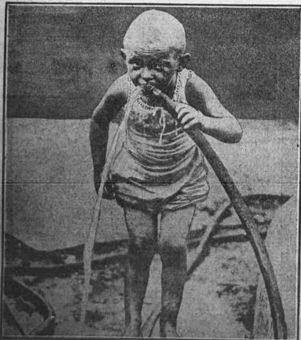
A HOT BUT HAPPY YOUTH

Typical hot-weather scene on the sidewalks of Philadelphia.