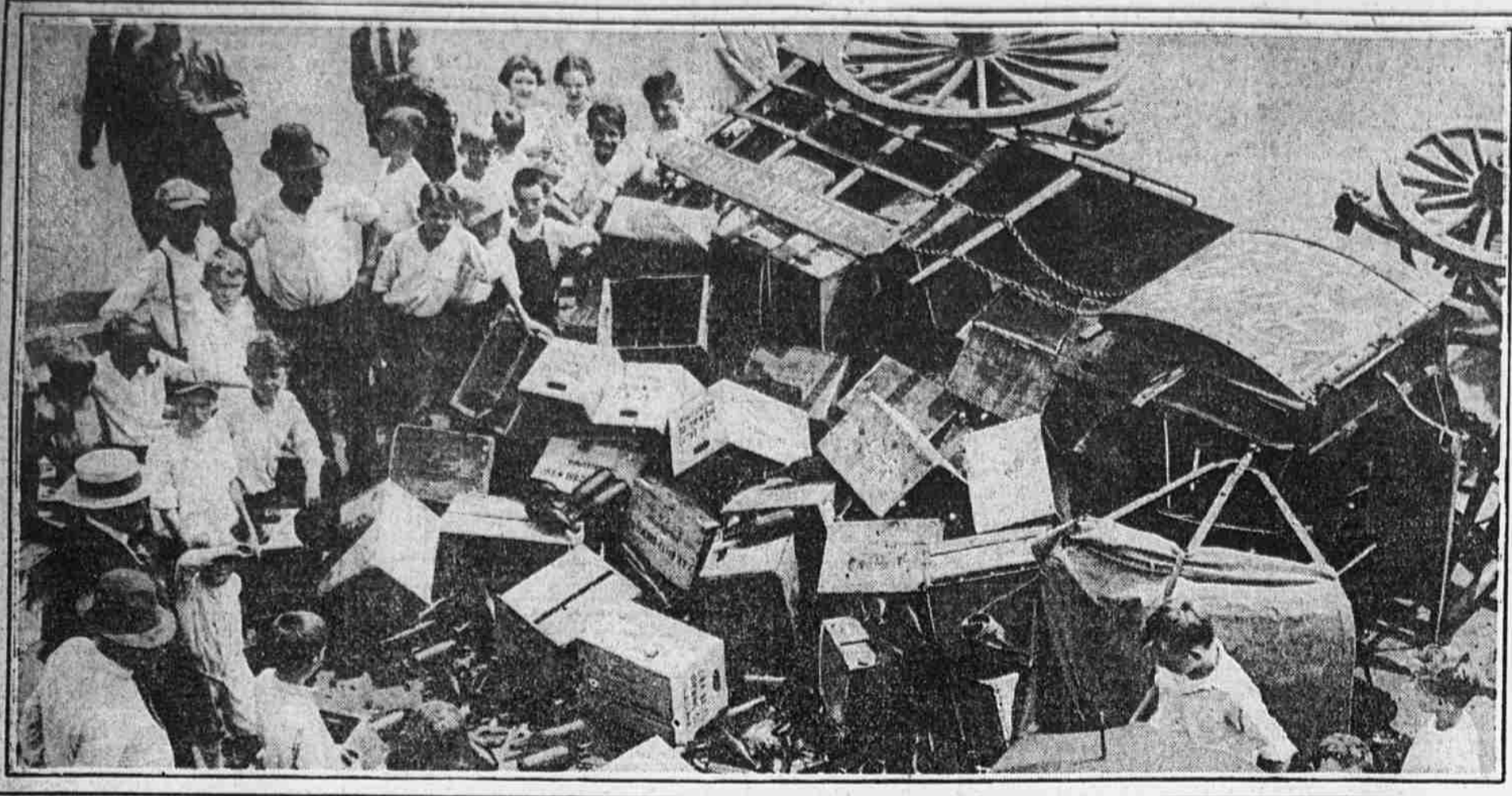
WHEN THE AMBER BREW RAN LIKE WATER THROUGH THE STREETS

A DAY'S ACTIVITIES IN A BUSY WORLD GRAPHICALLY PORTRAYED BY THE CAMERA MAN