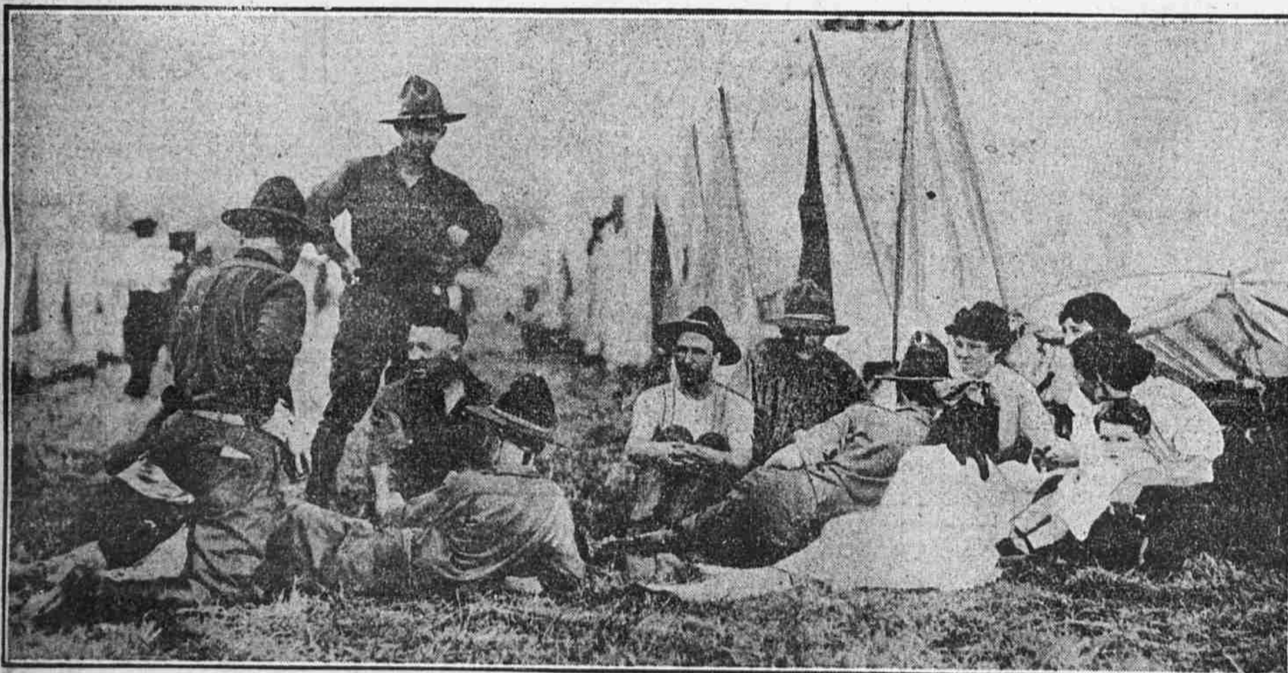
WIVES AND DAUGHTERS MAKE THEMSELVES AT HOME IN THE P. O. S. OF A. STATE CAMP