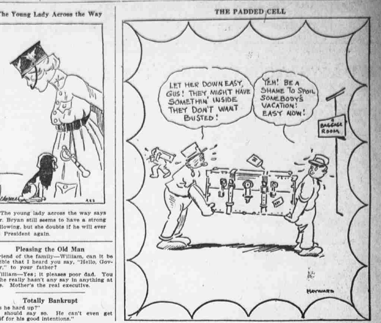
The Young Lady Across the Way Mr. Bryan still seems to have a strong following, but she doubts if he will ever be President again.

Pleasing the Old Man Friend of the family—William, can it be possible that I heard you say, 'Hello, Governor,' to your father? William—Yes; it pleases poor dad. You see, he really hasn't any say in anything at home. Mother's the real executive.