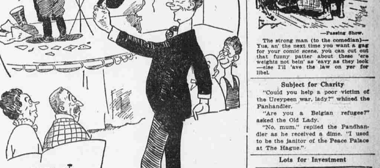
Professional Jealousy The strong man (to the comedian)—'You, as the next time you want a gag for your comic scene, you can cut out that funny patter about these 'ere weights not bein' as 'easy as they look'—else I'll 'ave the law on yer for libel.

Subject for Charity 'Could you help a poor victim of the Ureypren war, lady?' whined the Panhandler. 'Are you a Belgian refugee?' asked the Old Lady. 'No, mum,' replied the Panhandler as he received a dime. 'I used to be the janitor of the Peace Palace at The Hague.'