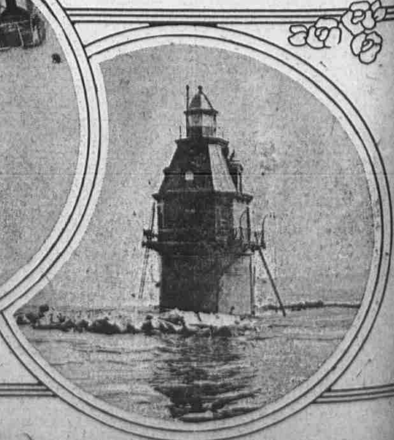
A REAL LADY OF THE SEA AND HER HOUSE She is the figurehead from the old ship John, which was wrecked off the mouth of the Delaware 150 years ago. On the right is the 'Ship John' lighthouse, known to all Philadelphia mariners, built to prevent such wrecks in future.