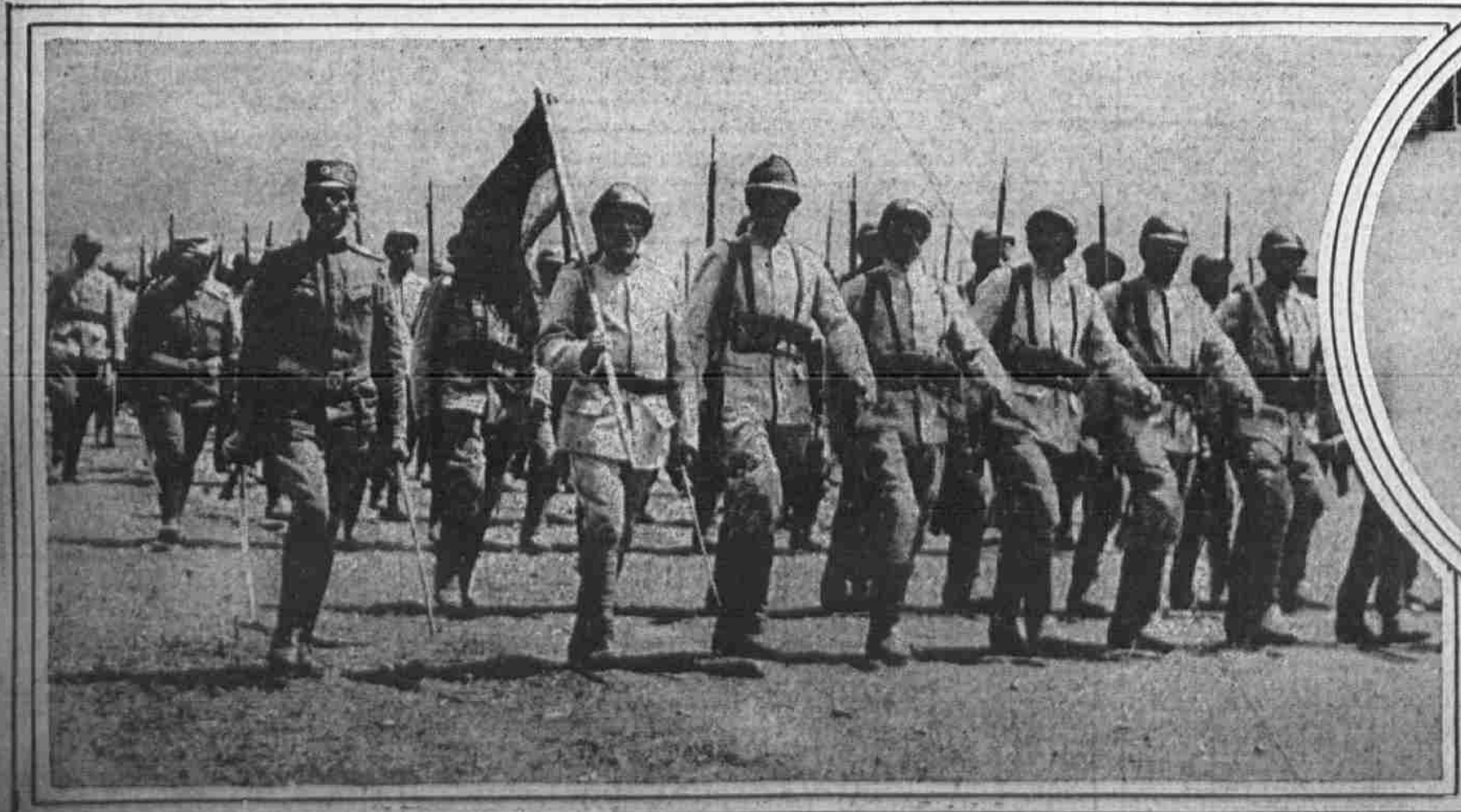
GERM ARMY, STEEL HELMETED AND NEWLY FITTED OUT, AGAIN MARCHES FORTH TO FACE THE BULGARS