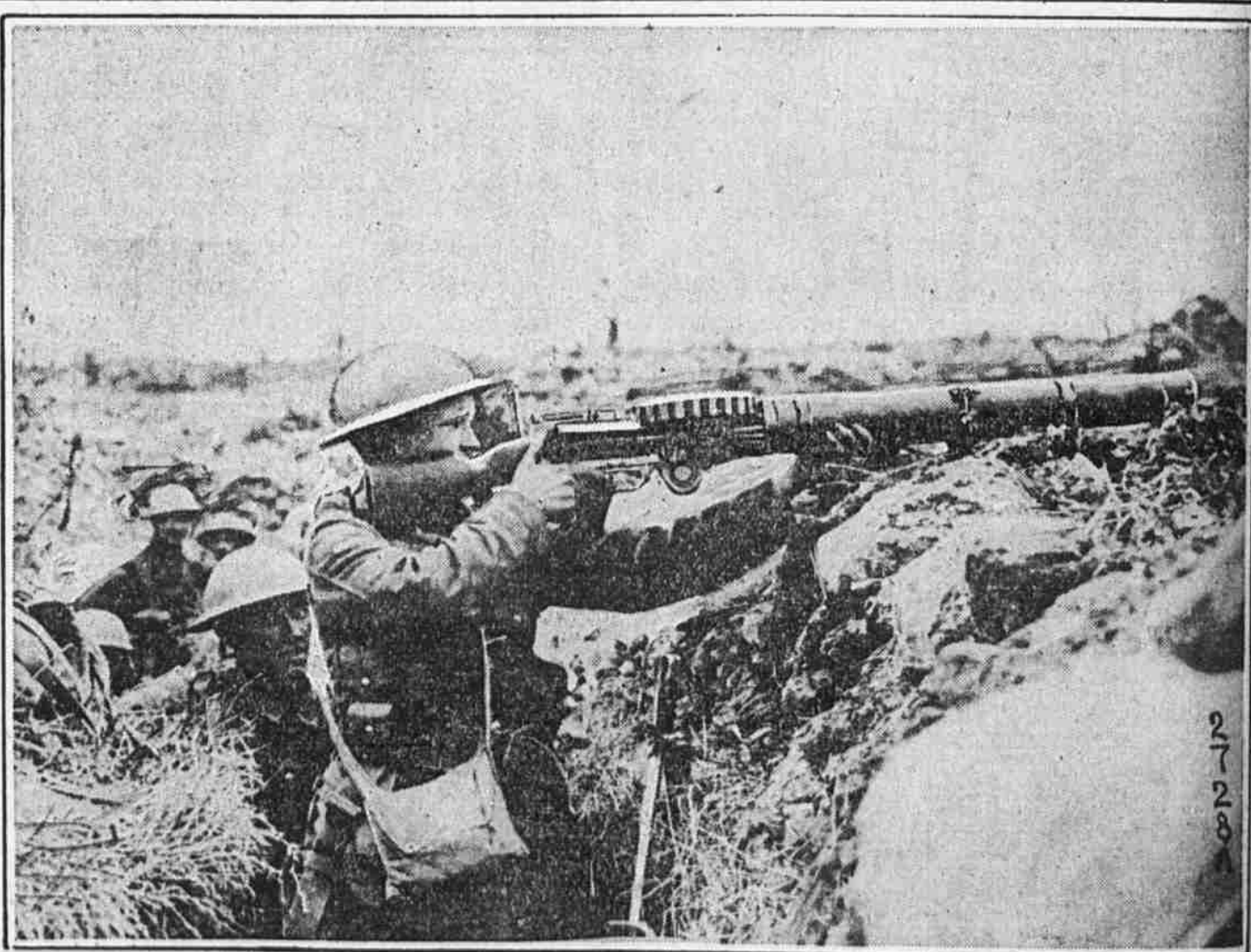
EFFICIENT LEWIS GUN IN ACTION IN A FRONT-LINE TRENCH NEAR OVILIER The Lewis gun, designed by an American, was rejected by the United States army officers. It has proved one of the greatest offensive and defensive weapons to the Allies.