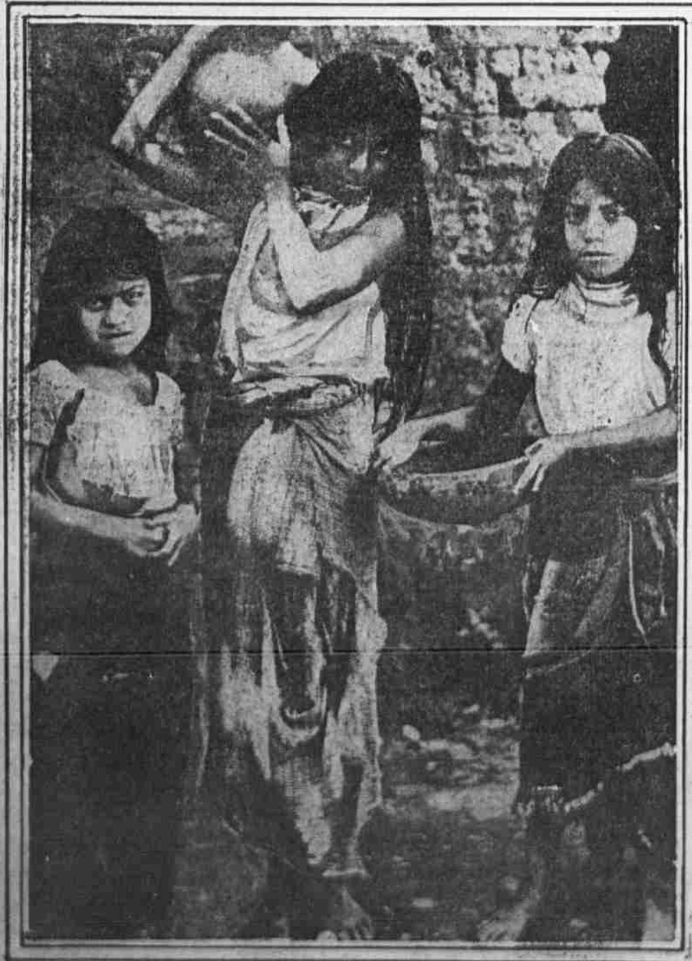
A FEW FRIENDLY MEXICANS The photograph, taken by one of the United States soldiers across the border, shows three little Mexican girls posing on their way from the well to the kitchen.