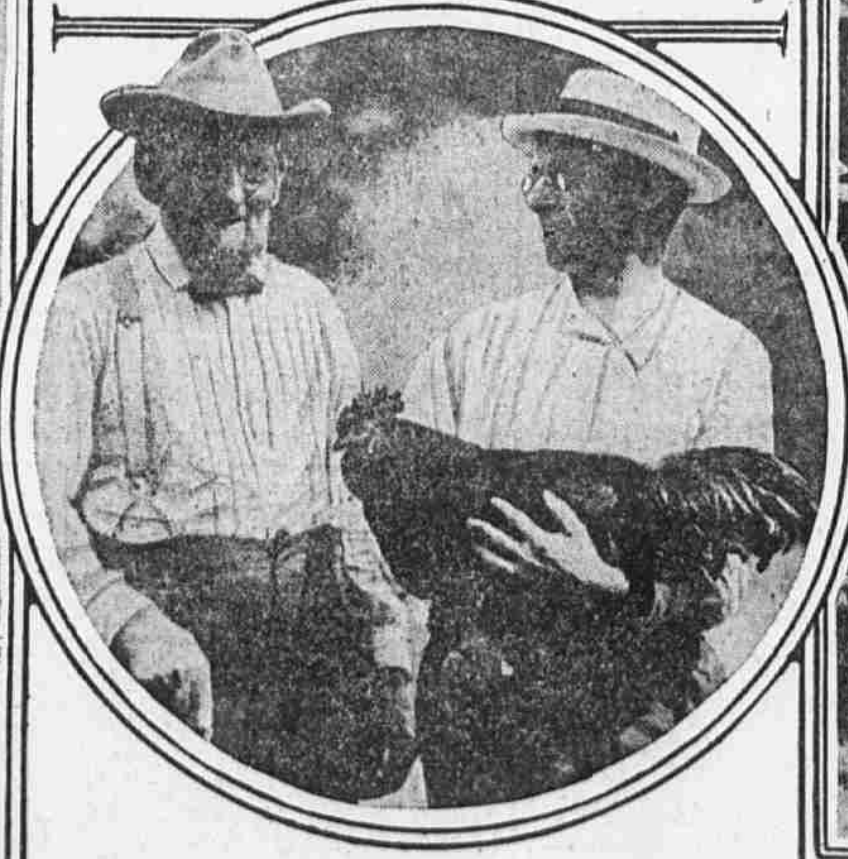
BLUE-RIBBON ROOSTER OF THE GRANGE PICNIC