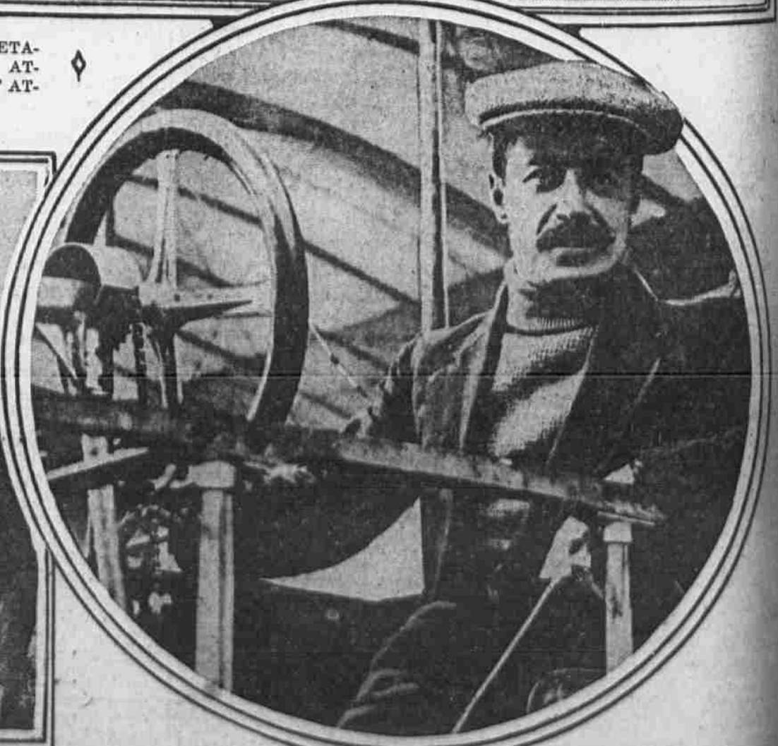
DARING FRENCH AVIATOR CAPTURED Sublieutenant Marchal, after covering 812 miles and dropping proclamations on Berlin, was captured when he was compelled to land at Cholm, Poland, because of engine trouble.