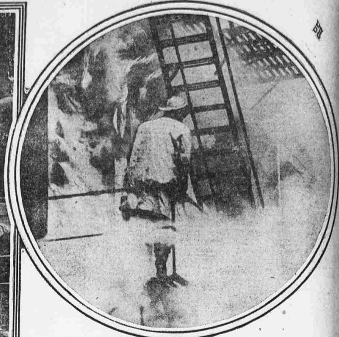
TRAPPED BY FLAME, WITH HIS HOSE DRY This was the plight that one of the firemen fighting the Chestnut street blaze found himself in. He was completely enveloped by flames, but escaped.