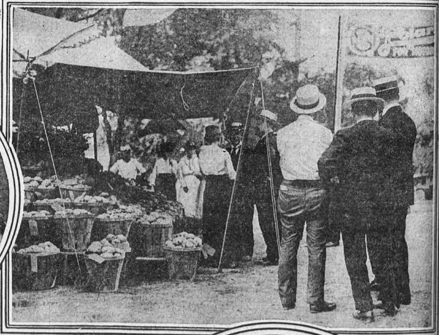
JUST ONE OF MANY VEGETABLE EXHIBITS THAT ATTRACTED THE FARMERS' ATTENTION