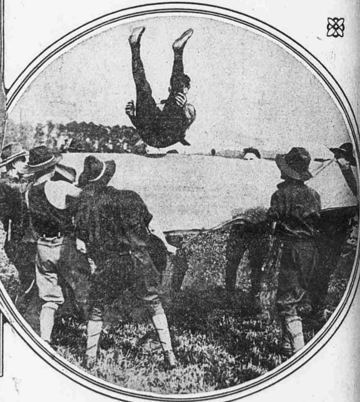
AN ARMY CUSTOM IS DULY OBSERVED BY NEW MILITARY CAMP The Order of Independent Americans has set up its camp this week on the grounds of the Motor Speedway at Warminster. The opening ceremonies included a little blanket tossing.