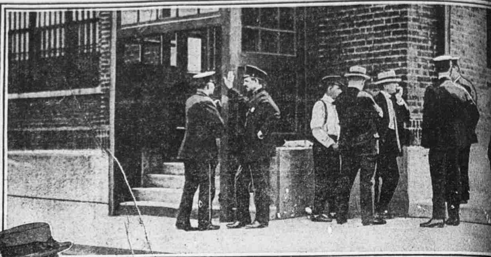
CAR BARN'S PEACEFUL DESPITE STRIKE CALL A leisurely group at the Eleventh and Luzerne streets barn, one of the largest in the city, a short time after the strike order was issued. Policemen on guard had nothing to do.