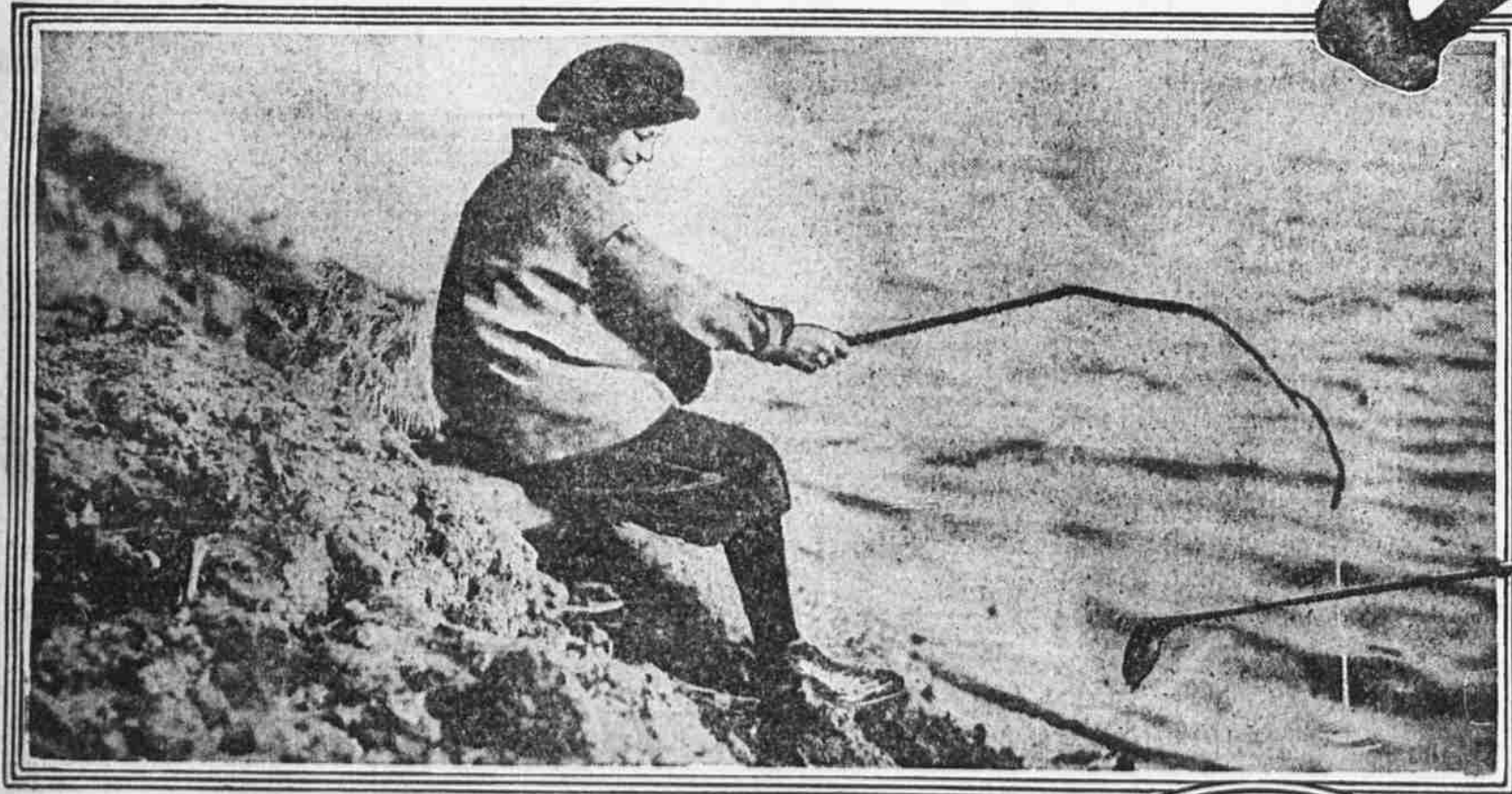
"THE DAYS OF REAL SPORT" A solitary fisherman on the Schuylkill. This picture might also be called "The Triumph of Hope Over Experience."