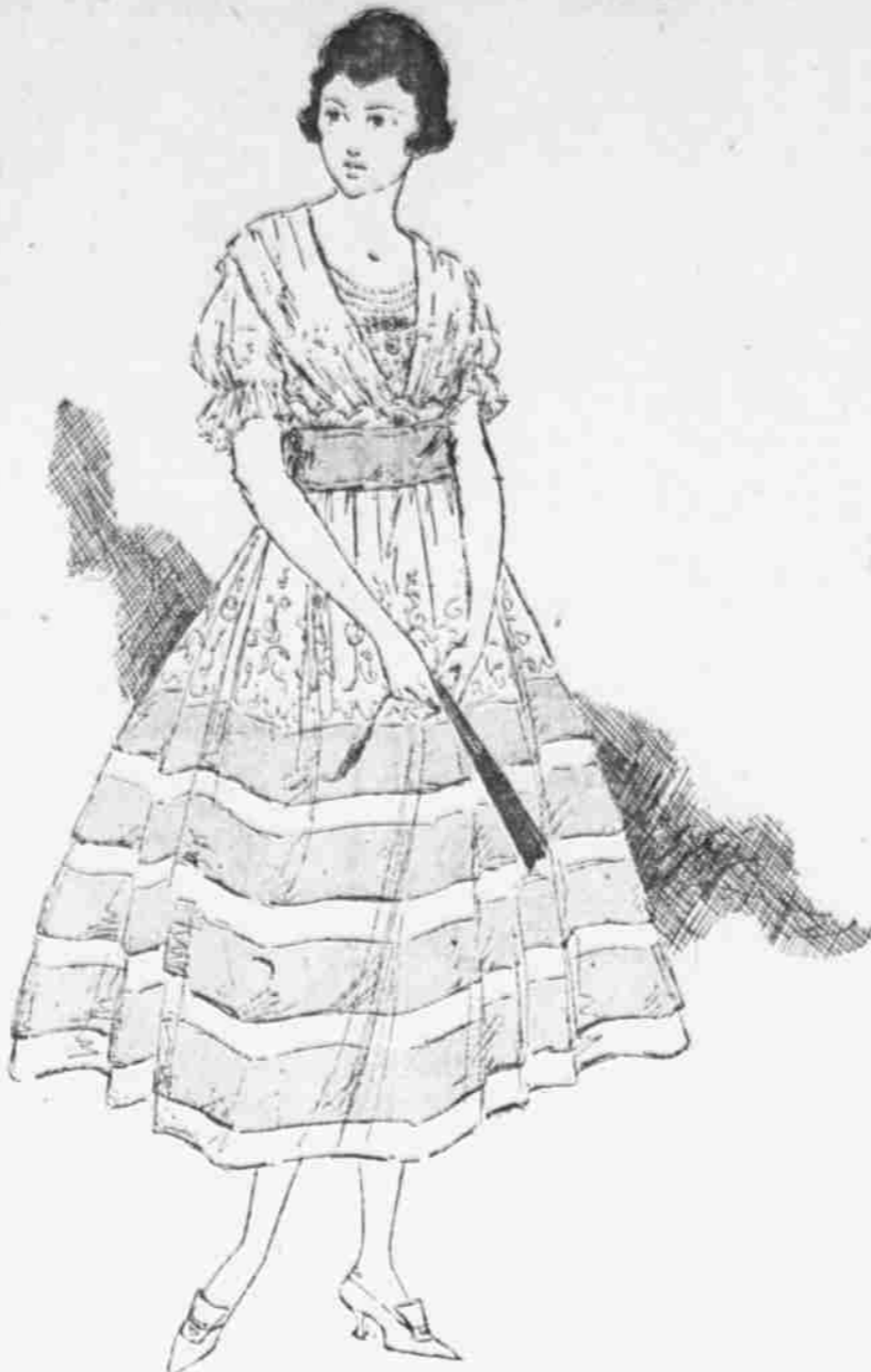
MIDSUMMER DANCE FROCK

EMBROIDERED net is used to develop this quaint frock which may serve for the dance or any of the many summer informal or semiformal affairs. The embroidered net cascade effect is veiled in plain net in surplice style, while the plain net puffed sleeves which also veil embroidered net, are finished with plaited frills.