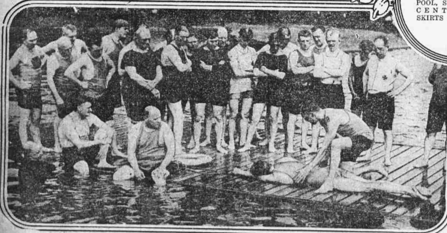
FAIRMOUNT PARK GUARDS GET LESSONS IN RESCUE WORK ON THE SCHUYLKILL