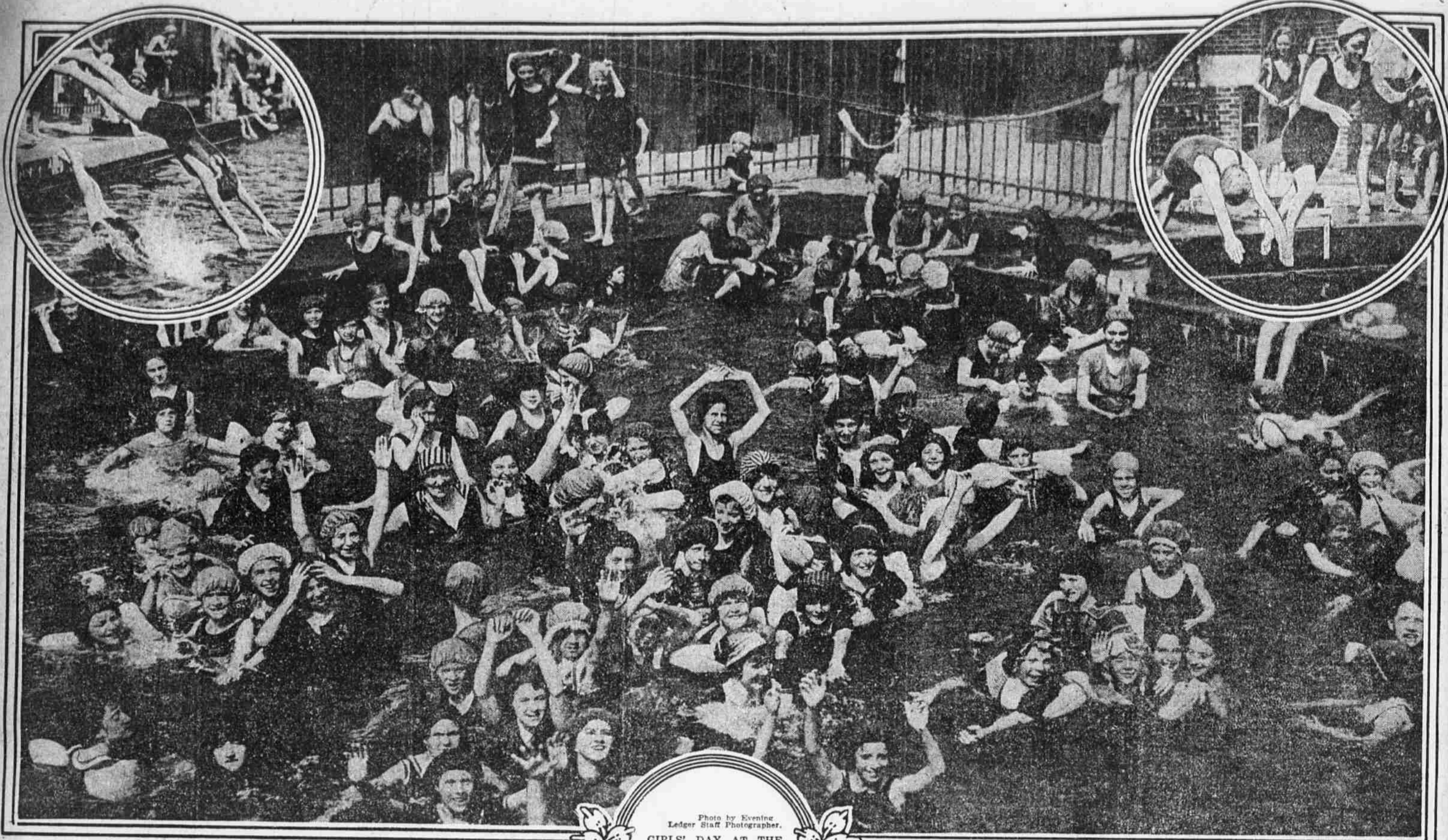
GIRLS' DAY AT THE MUNICIPAL BATHING POOL, SHERWOOD CENTRE, WHERE SKIRTS ARE BARRED.

GRAPHIC NOTES AND COMMENT ON THE VARIED NEWS OF THE DAY AS RECORDED BY THE CAMERA