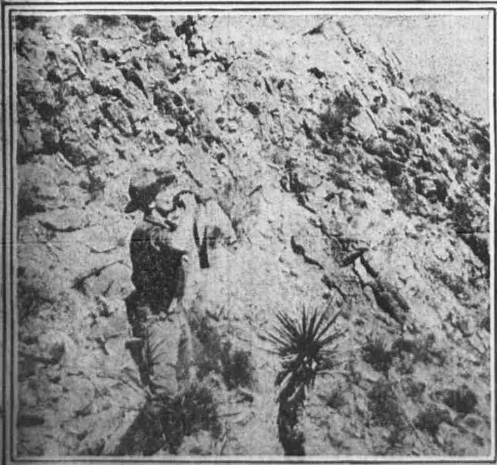
AMERICAN-MADE MONEY IS DISTRIBUTED IN MEXICO CITY Scene at a police station in the capital, where residents came to exchange the old "Vera Cruz" currency, worth about 10 cents a peso (48 cents), for newly engraved notes backed by metallic deposits.

While others go to sea and mountains, Starr Garden's children make the most of their breathing space, situated in one of the city's most congested centers.