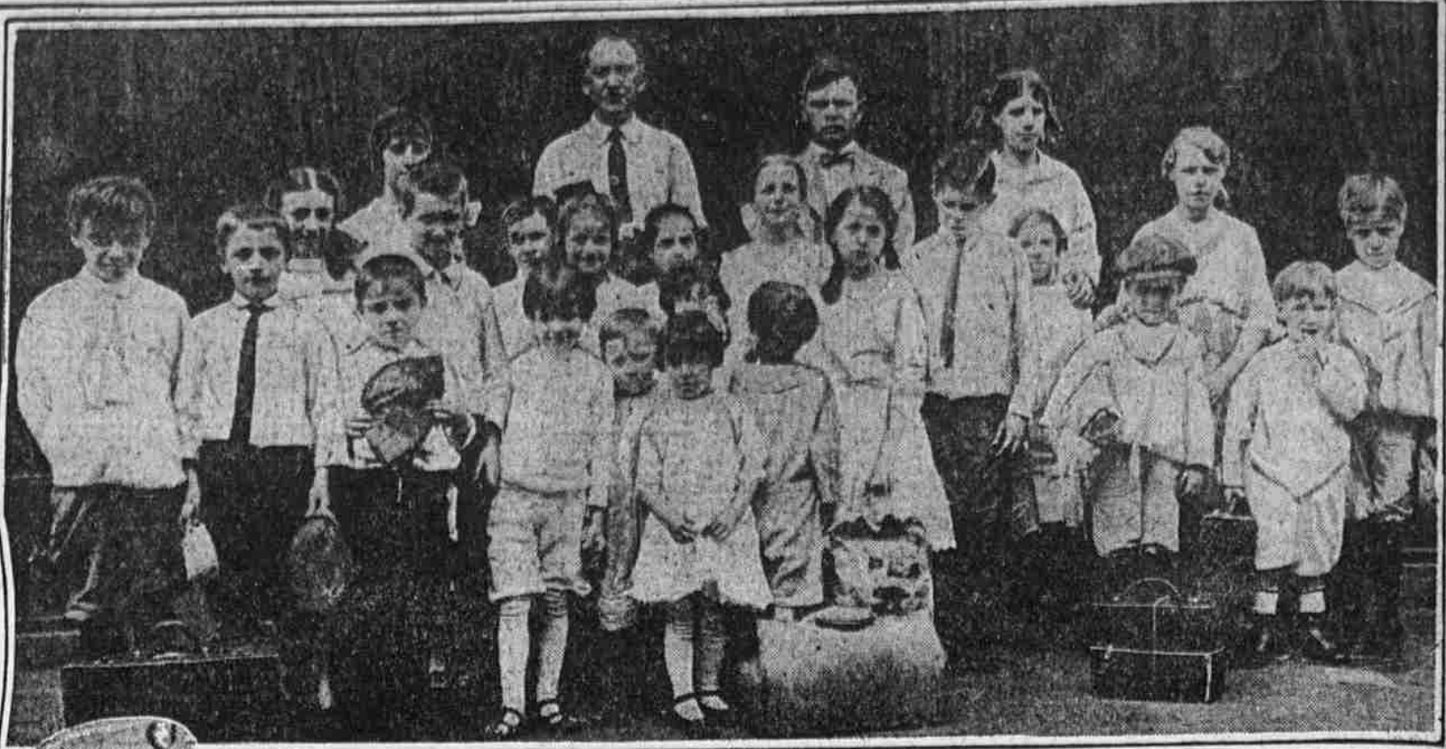
CHILDREN FROM THE TENEMENTS OFF FOR FRESH-AIR This is the flock that went to Hatfield, Pa., yesterday in care of the Volunteers of America, who send a new batch out each week.

Who, when the humidity is trying to get past the 90 mark, has not felt the temptation to which these youngsters are giving free rein?