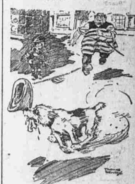
"Happiness is the pursuit only of something, not the catching of it.