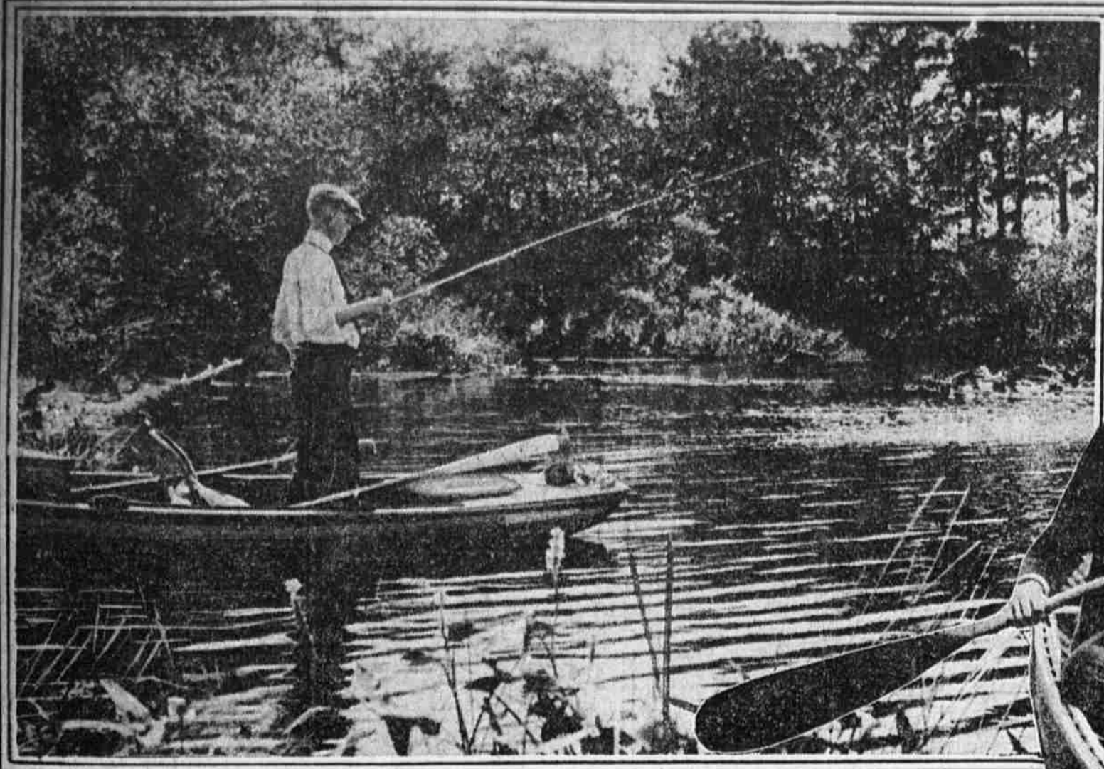
IN THE GRASS WHERE THE BIG ONES LIE

WHEN THE VACATION SEASON COMES ROUND ONE'S THOUGHTS TURN TO ROD AND TACKLE