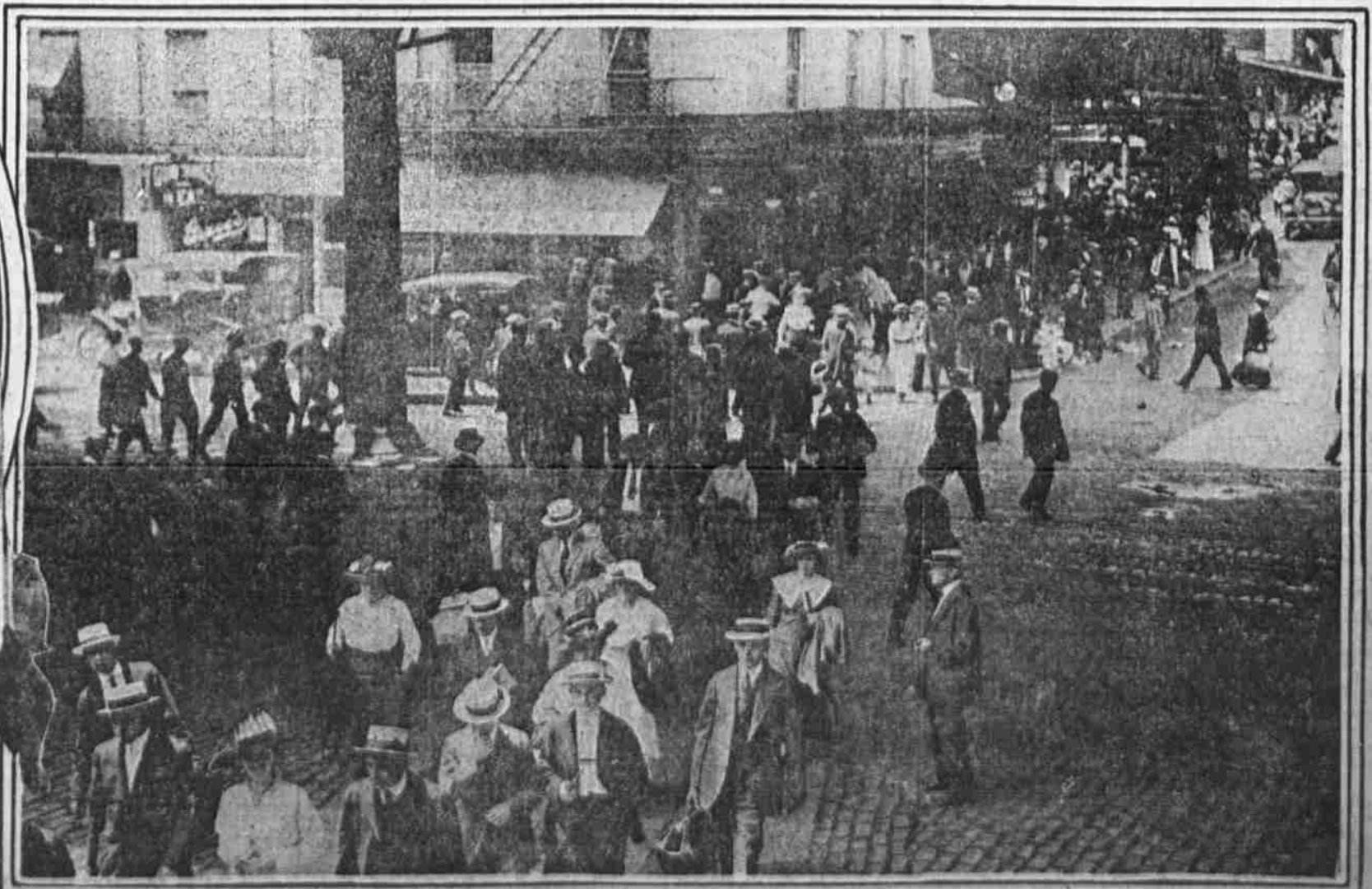
VACATIONERS OFF VIA THE JERSEY FERRIES