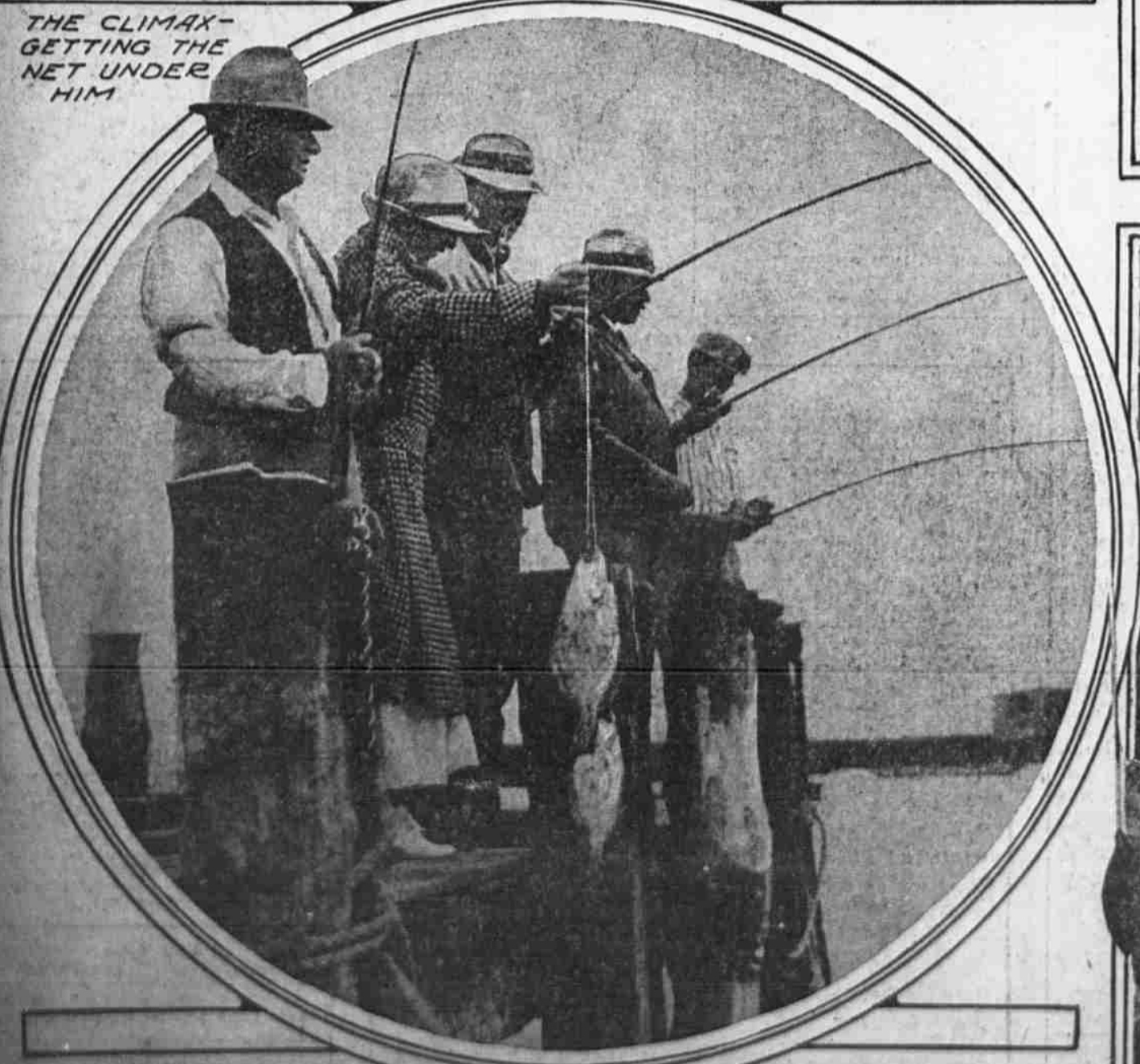
FLOUNDER FISHING IS GOOD ALONG THE COAST