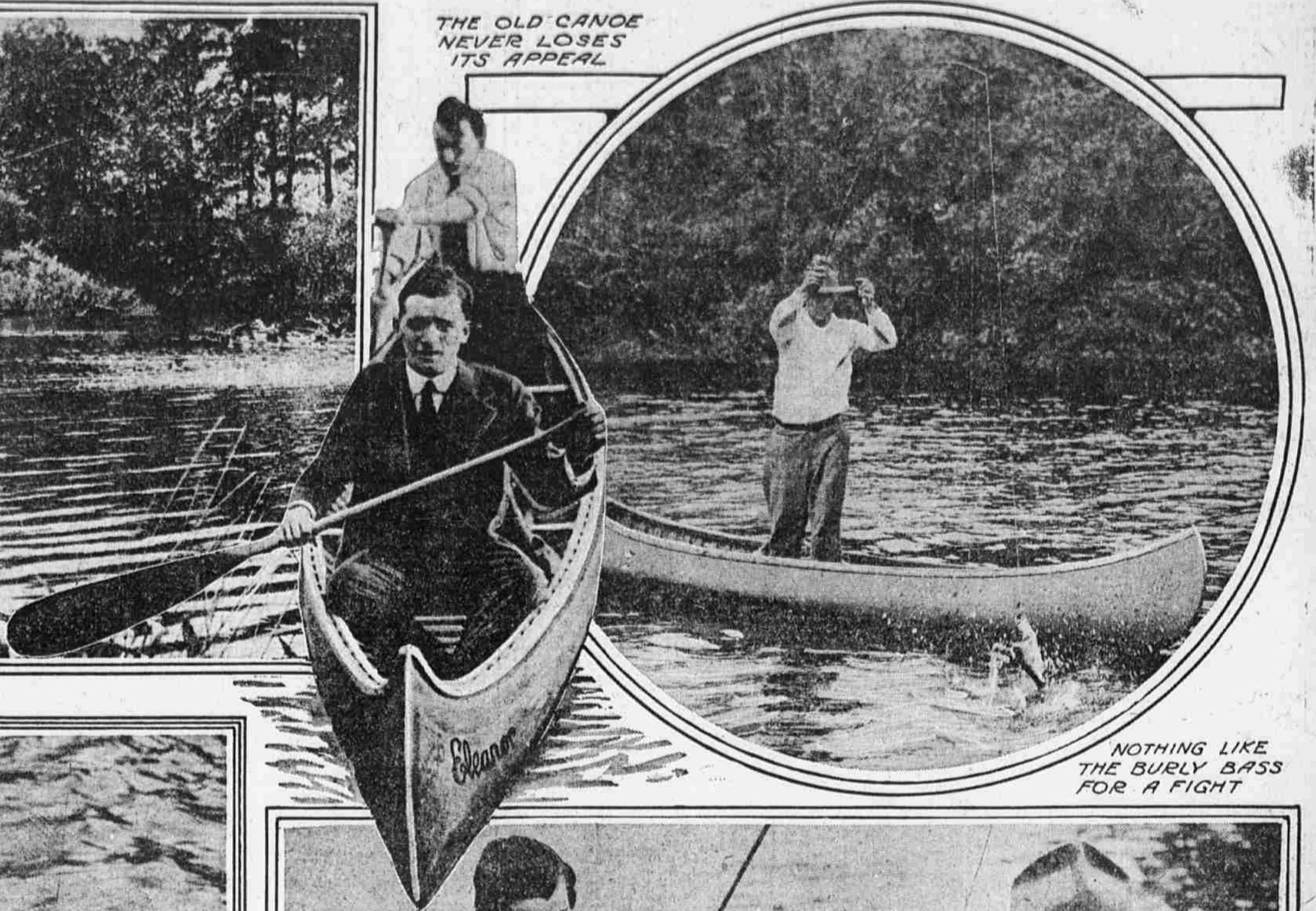
NOTHING LIKE THE BURLY BASS FOR A FIGHT