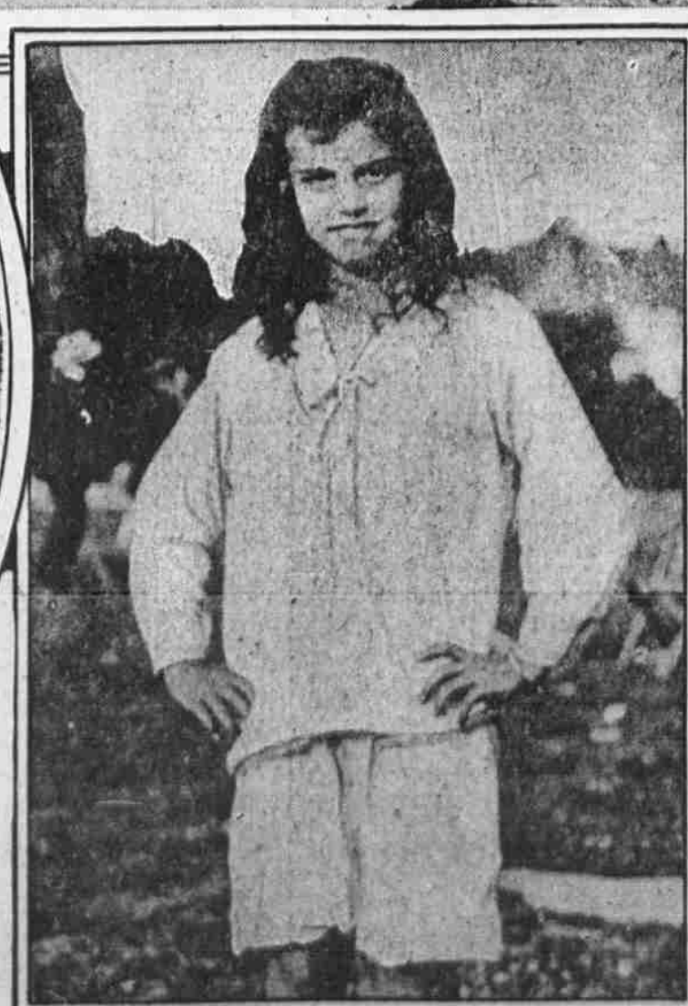
SWARTHMORE'S CHAMPION GIRL ATHLETE

One of the new pictures taken since the "big push" began. The spick and span appearance of men and horses is noticeable. Great Britain is sparing no expense to make the present attack successful.