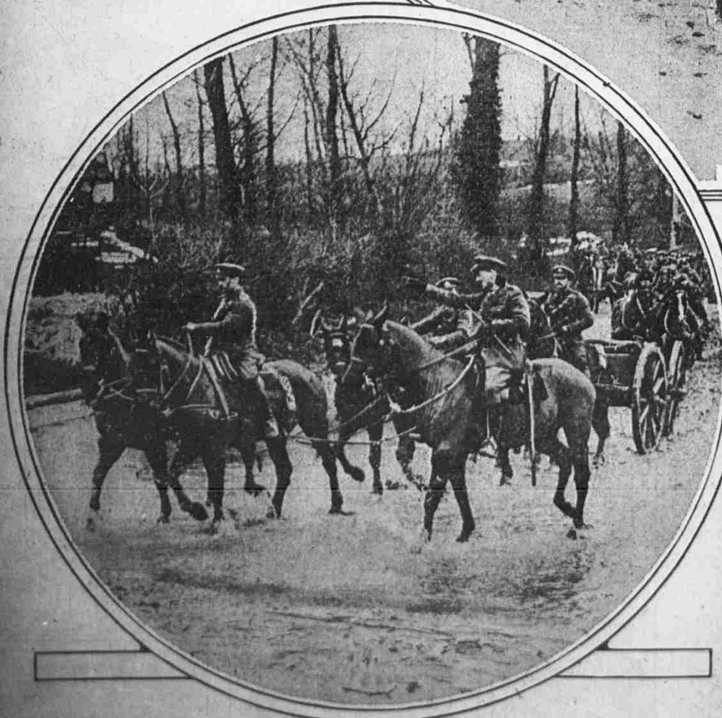
NEW BRITISH BATTERY RUSHING TO THE FRONT

One of the new pictures taken since the "big push" began. The spick and span appearance of men and horses is noticeable. Great Britain is sparing no expense to make the present attack successful.