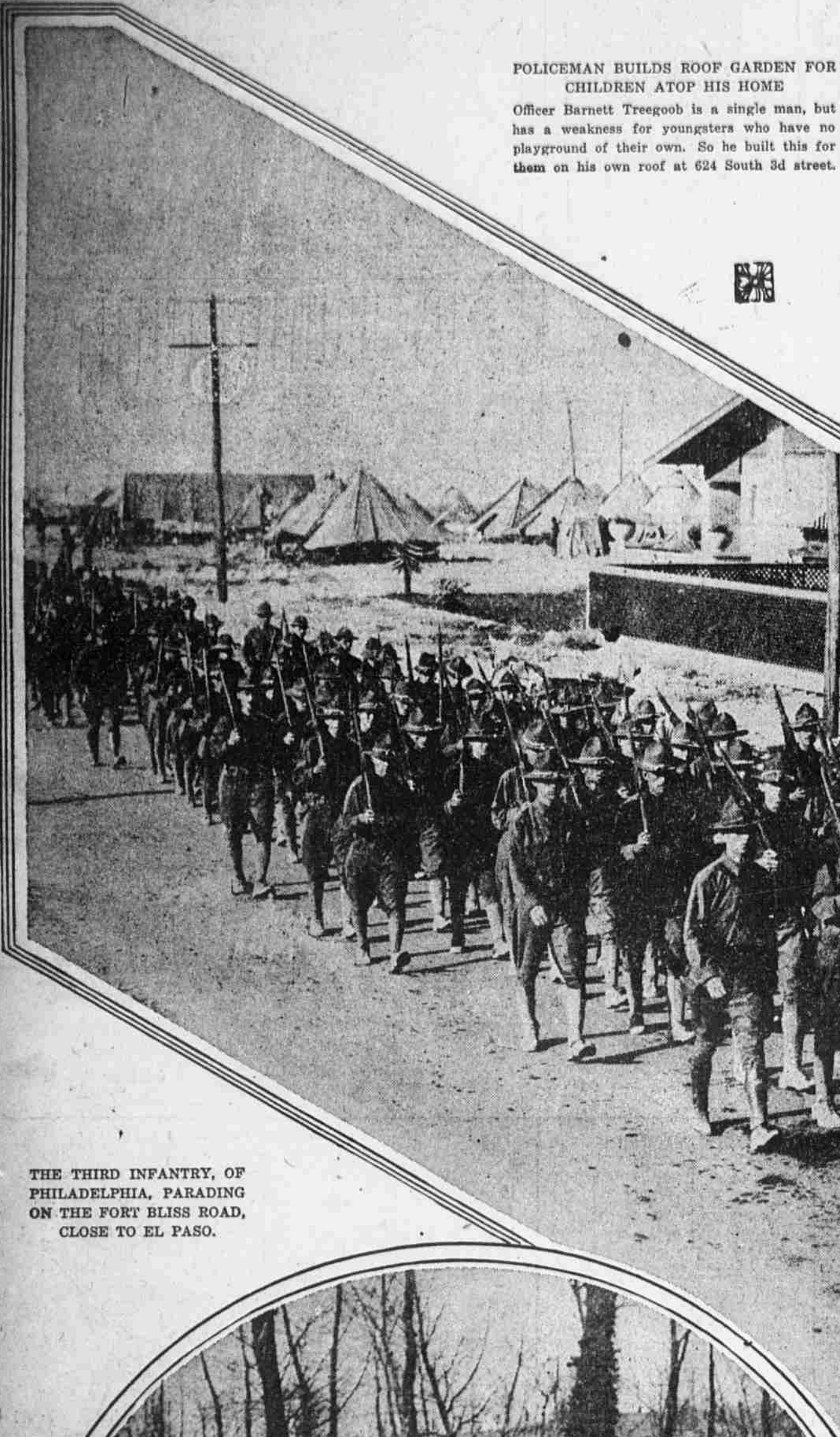
THE THIRD INFANTRY, OF PHILADELPHIA, PARADING ON THE FORT BLISS ROAD, CLOSE TO EL PASO.