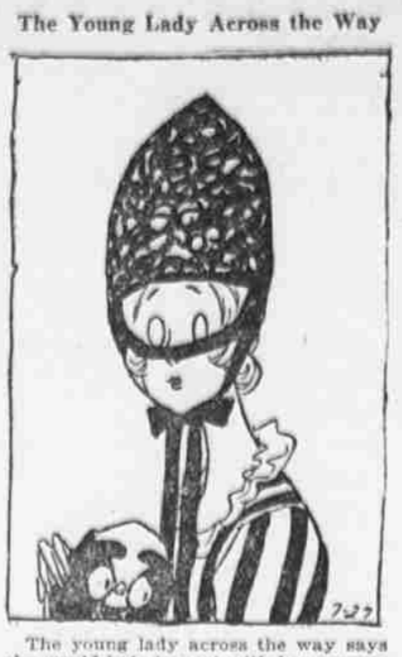
The Young Lady Across the Way

HOUSEHOLD LOAN CO. 131 South Broad Street YOU CAN BORROW MONEY ON DIAMONDS, JEWELS, ETC.