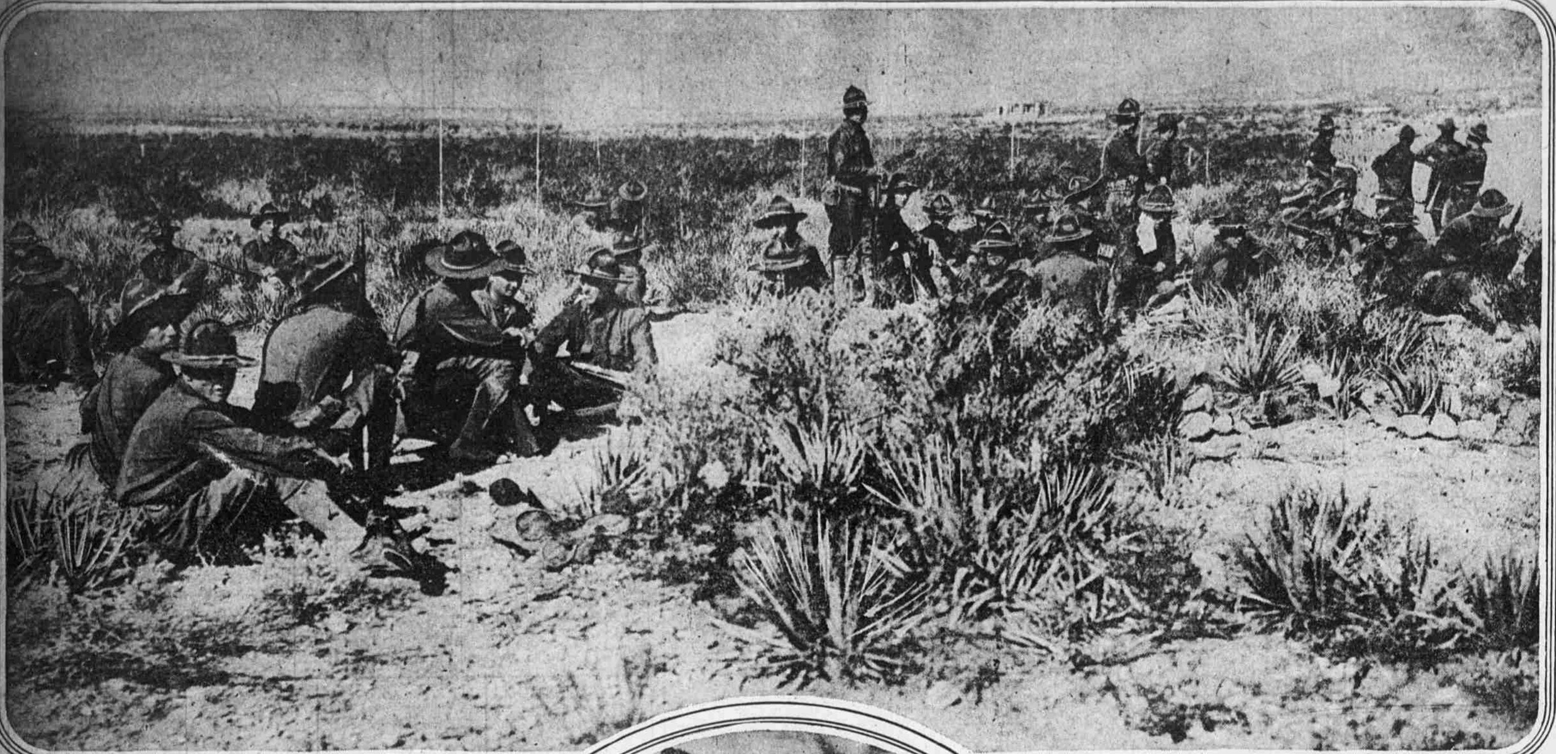
FIRST REGIMENT TAKES HARDENING-UP HIKE TOWARD MOUNT FRANKLIN RANGE NEAR EL PASO The men are shown taking advantage of the 10 minutes of rest which they are allowed every 50 minutes while tramping across the cactus-studded mesa.

GRAPHIC NOTES AND COMMENT ON THE VARIED NEWS OF THE DAY AS RECORDED BY THE CAMERA