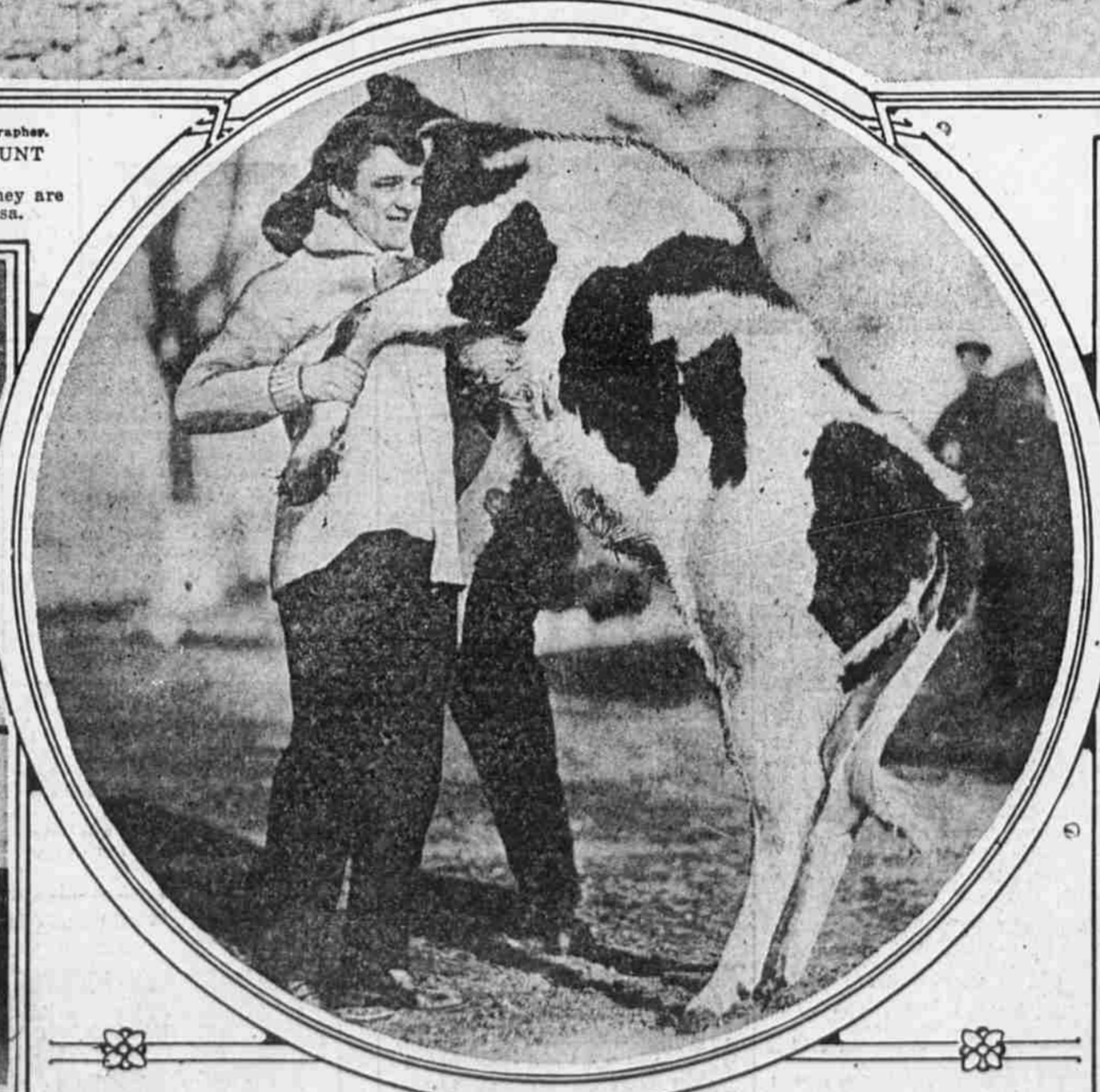
FREDDY WELSH AT HIS FAVORITE SPORT The lightweight champion appears here in training for his bout with Benny Leonard, which is to take place Friday night in Brooklyn.