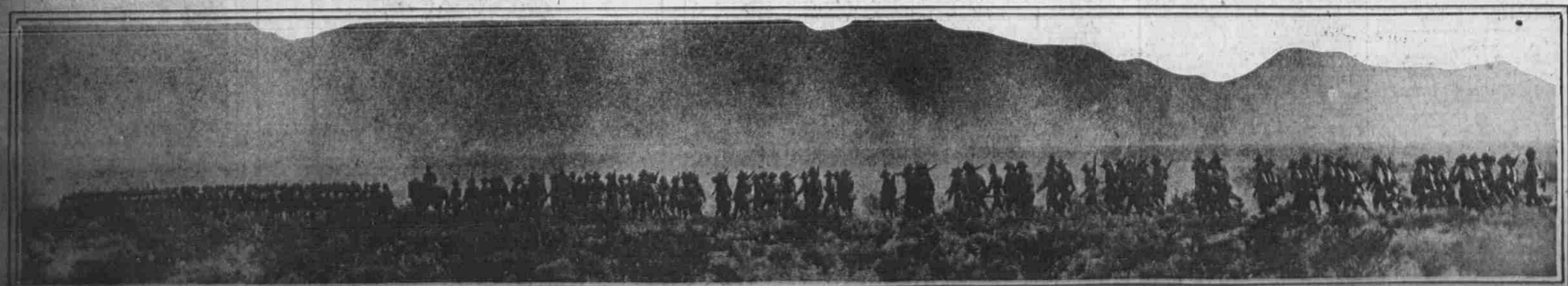
FIRST BRIGADE OF PENNSYLVANIA STRUNG OUT IN LONG COLUMN ON PRACTICE MARCH AT FORT BLISS