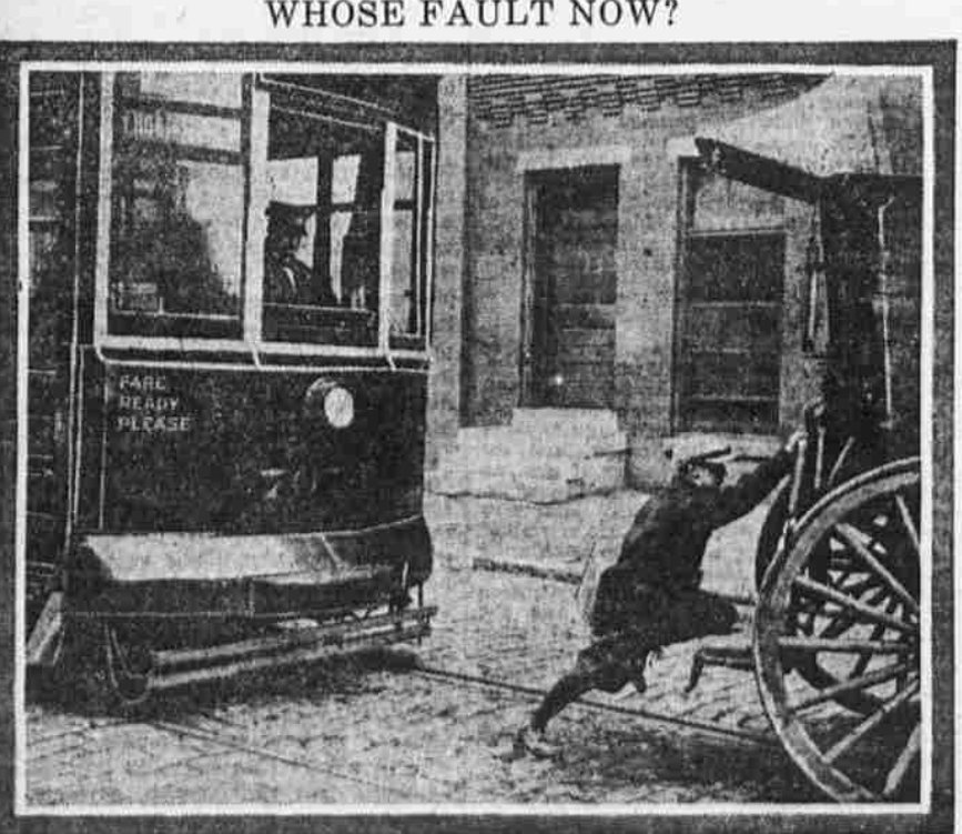
It's cheaper to buy ice than pay for it this way!