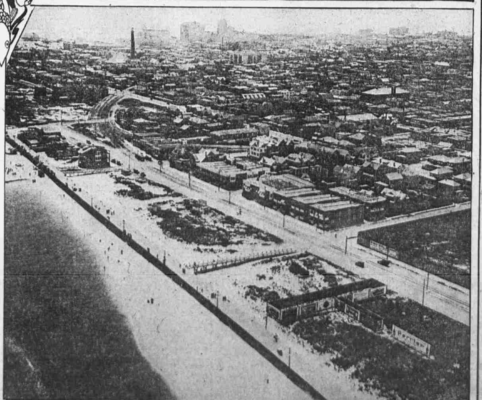
EVENING LEDGER STAFF PHOTOGRAPHER SAILS OVER THE TOWN BY THE SHORE ALL THE WAY FROM THE CENTRAL HOTEL DISTRICT TO THE INLET. OBTAINING NEW VIEWS FROM ON HIGH Above is a hawk's-eye sweep of the bathing centre of Atlantic City. The myriad dots which speckle the beach and water like so many swarming gnats are all bathers. The broad white streaks, of course, are the foaming breakers. Further out, toward the lower left of the picture, the surf has formed itself into an almost perfect V, with crowns of white caps. On the left is Young's old pier, jutting out into the ocean. On the right a portion of Steeplechase Pier is visible. The lower picture at the left shows the winding Inlet, the yacht pier and the baseball grounds. On the right is a view looking eastward along Atlantic avenue, the aeroplane being almost over the Inlet. The dark spire in the left background is the lighthouse. Inset in the upper picture are the photographer and the aviator, Beryl Kendrick, who has a summer hydroplane station at the shore.