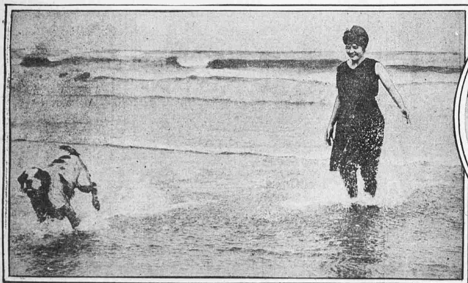
TAKE TOWSER OUT FOR A SPLASH IN THE SURF