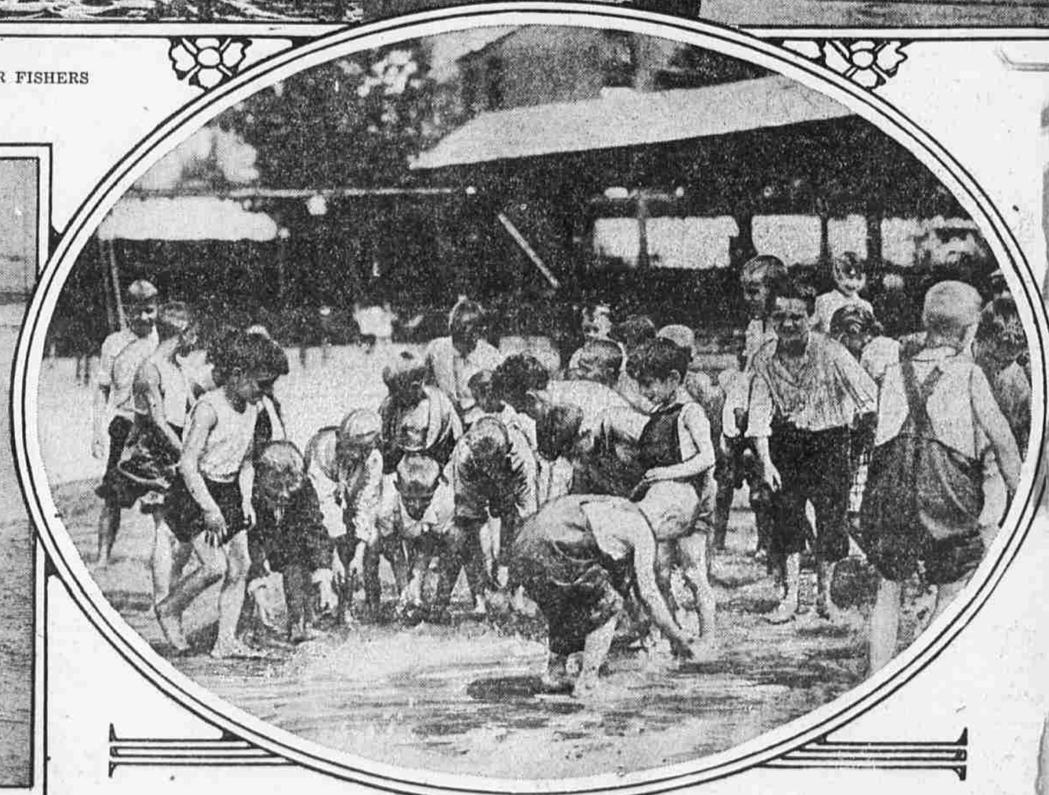
PULL OFF OUR SHOES AND WADE IN A PUDDLE