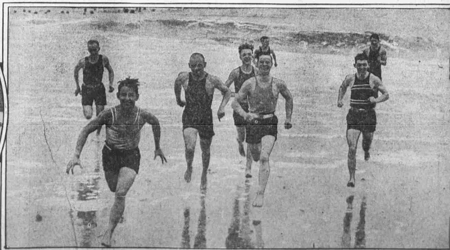
PLAY ON A NICE, DAMP BEACH