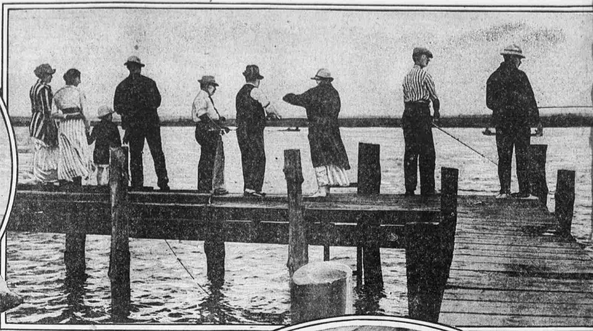
JOIN THE JERSEY FLOUNDER FISHERS AT STRATHMERE