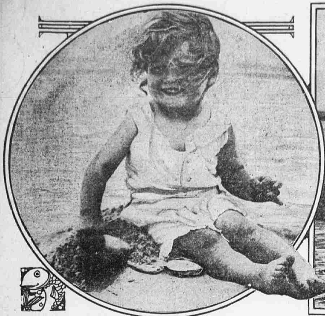
SIT ALL DAY IN OUR B. V. D.'S

WHAT WE WOULD ALL LIKE TO DO ON A HOT DAY LIKE THIS