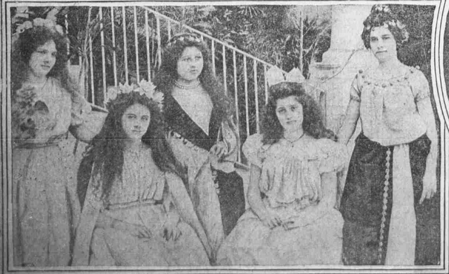
MEXICAN BEAUTIES WHO CHARM PHILADELPHIA'S SOLDIERS AT EL PASO A group of señoritas from over the border such as romantic guardsmen have been dreaming of ever since mobilization was ordered. That in some cases they have found their vision of dark-eyed señoritas a reality is evidenced by this picture just received from Camp Pershing.