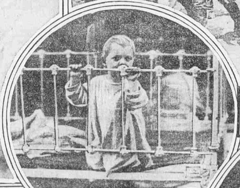
OUTDOOR BEDROOMS IDEAL THESE DAYS The young man has just awakened from a refreshing nap taken in the shade of a cool sidewalk near his home in South Phila.