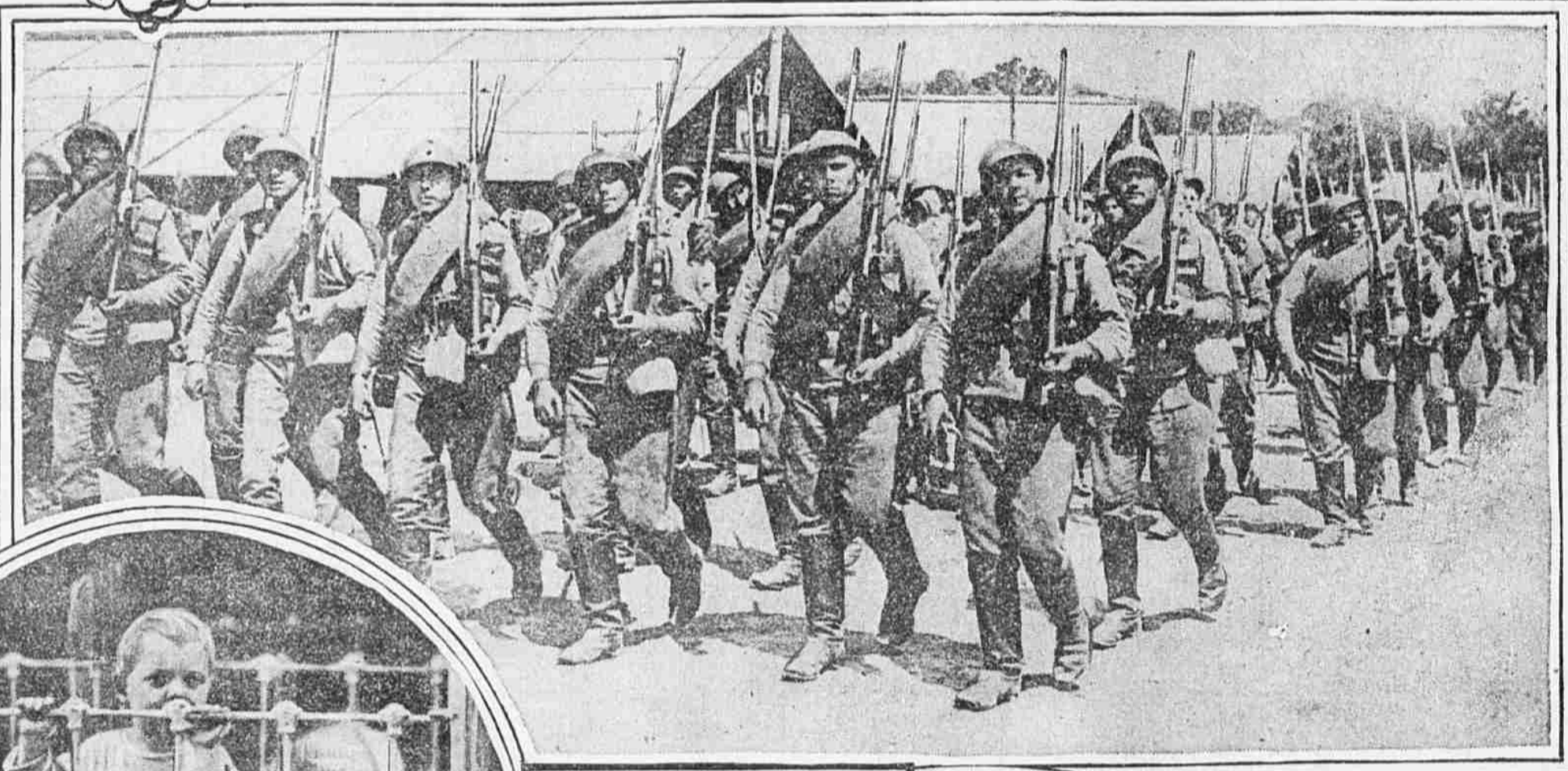
RUSSIANS IN FRANCE OFF TO FRONT Wearing the now-famous steel helmets and ready to help their allies.