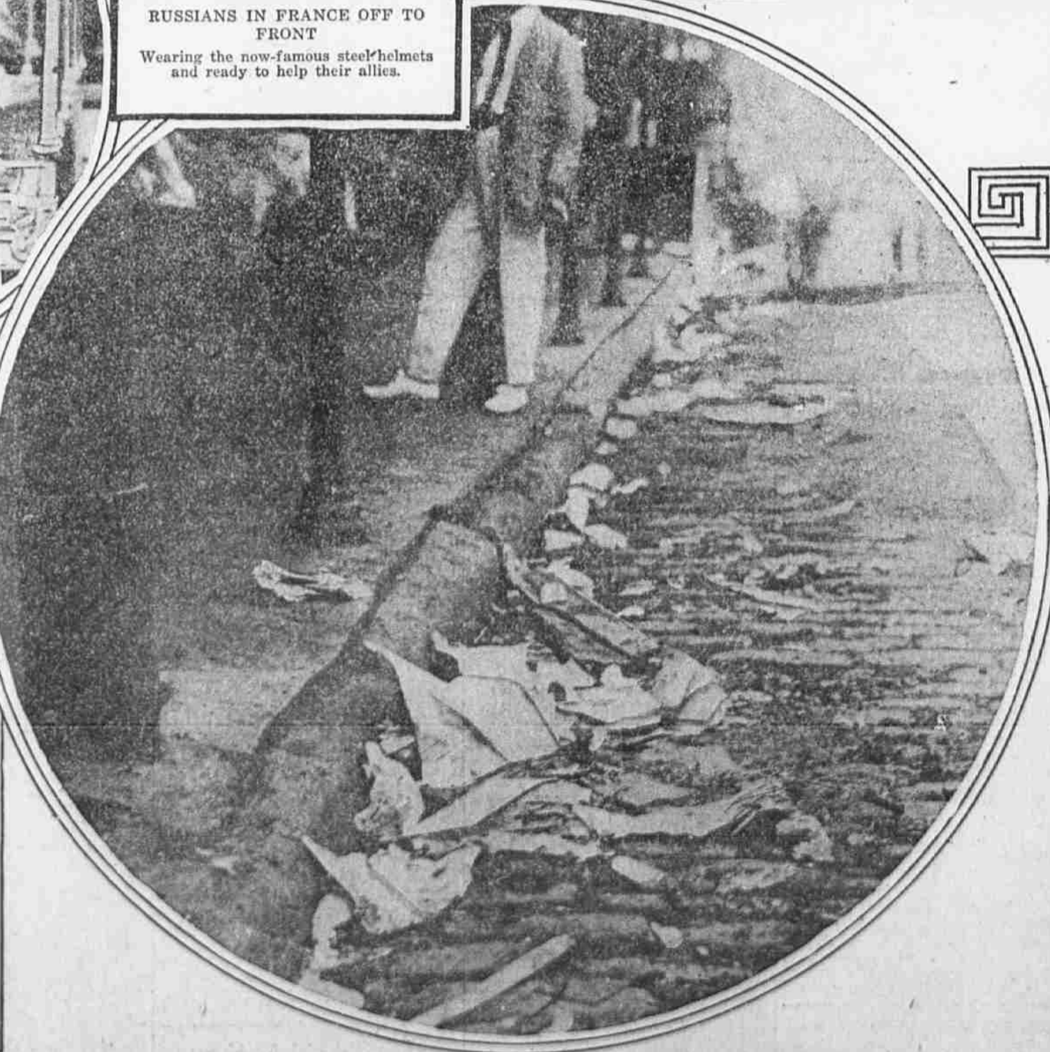
WHERE GERMS OF INFANTILE PARALYSIS MAY LURK—PROLIFIC SOURCE OF INFECTION This picture, taken on South Fourth street, is sufficient evidence that the municipal injunction to "can your rubbish" is not unwarranted. Announcement of the exact location is not necessary, as the city contains other spots equally favorable for propagating deadly germs.