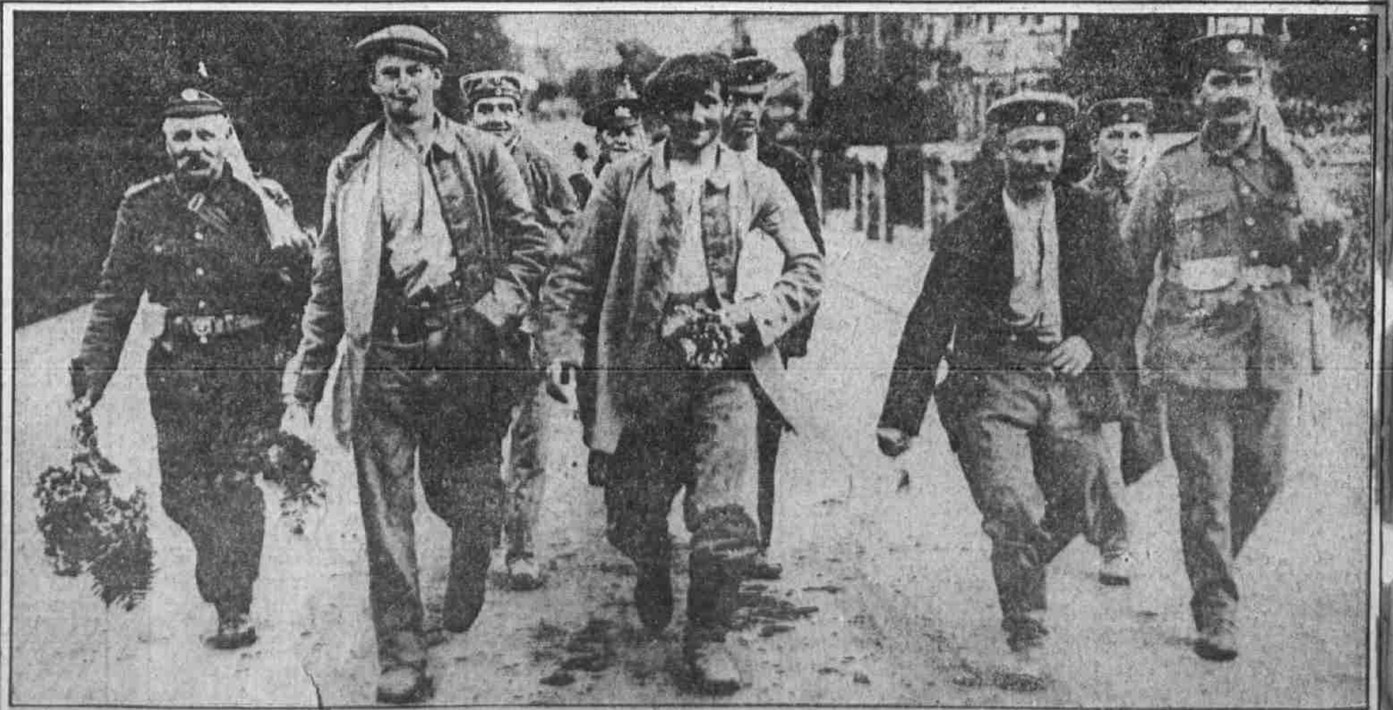
GERMAN PRISONERS IN BRITISH PRISON CAMPS ARE ALLOWED GREAT FREEDOM. HERE IS A GROUP RETURNING FROM A WALK NEAR DORCHESTER, ENGLAND