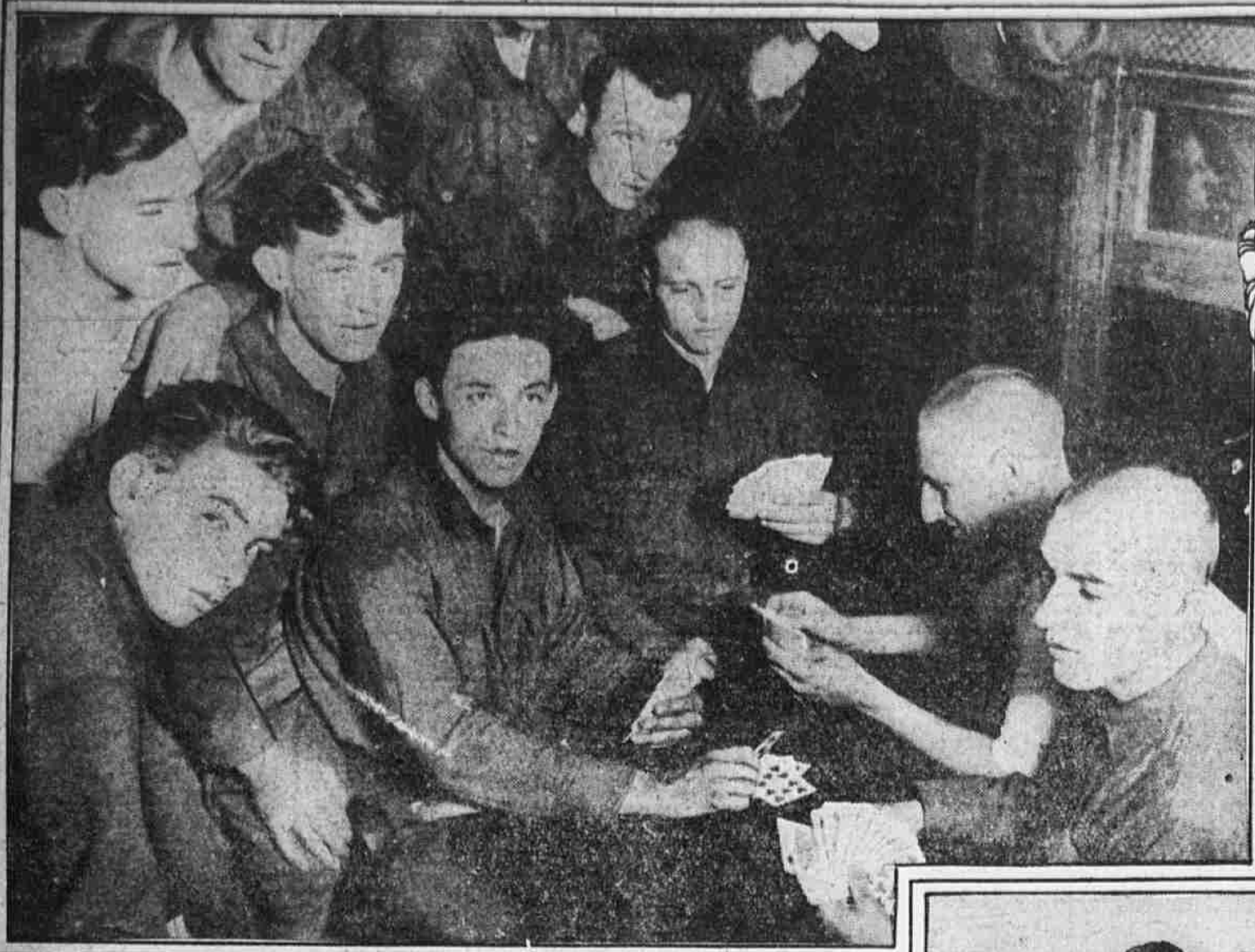
MEMBERS OF COMPANY C, 3D REGIMENT, N. G. P., PLAYING CARDS TO PASS AWAY THE TIME

WAR VIEWS FROM THE UNITED STATES AND EUROPE TAKEN FAR FROM THE SCENES OF ACTUAL BATTLE