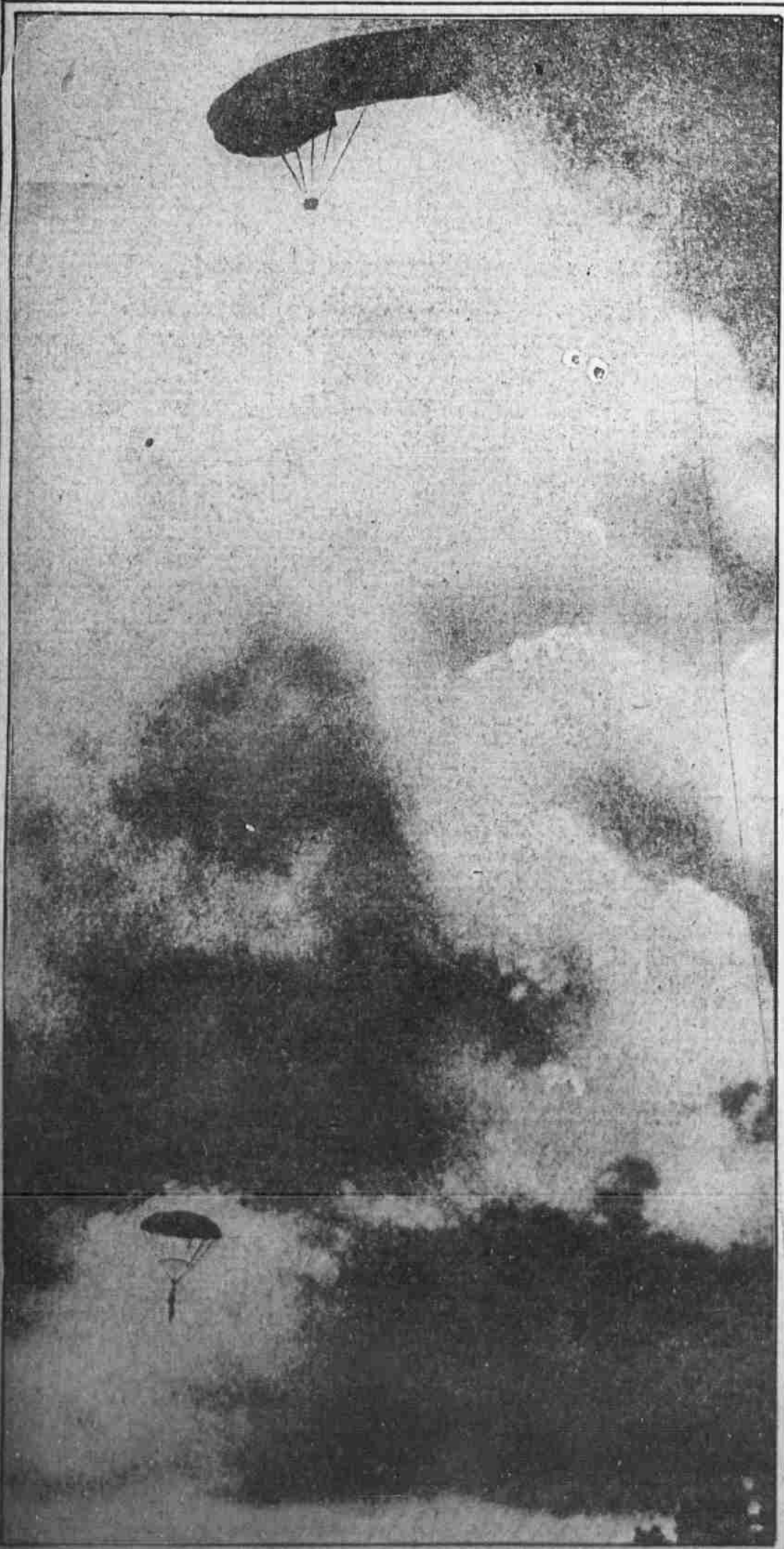
FRENCH AERONAUT DESCENDING BY PARACHUTE FROM AN OBSERVATION BALLOON THAT WAS BLOWN FROM ITS MOORINGS BY A GALE