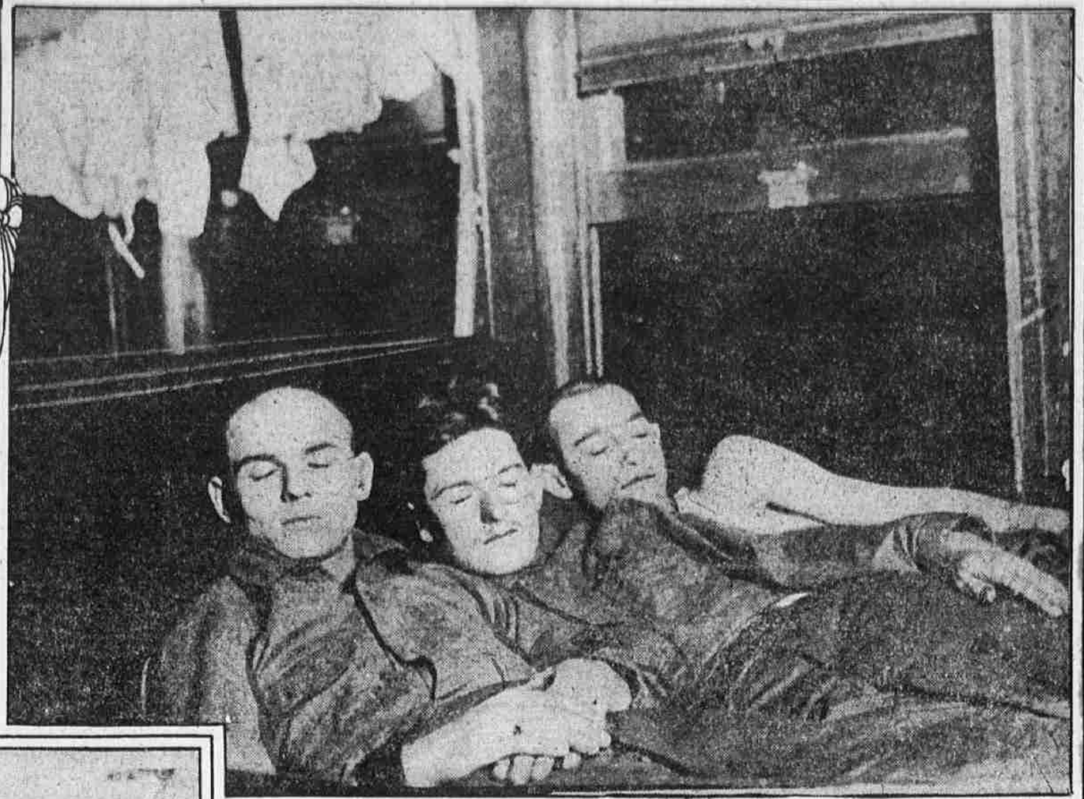
PENNSYLVANIA'S GUARDSMEN SLEPT THREE IN A SEAT ON THE LONG, HOT TRIP TO THE BORDER