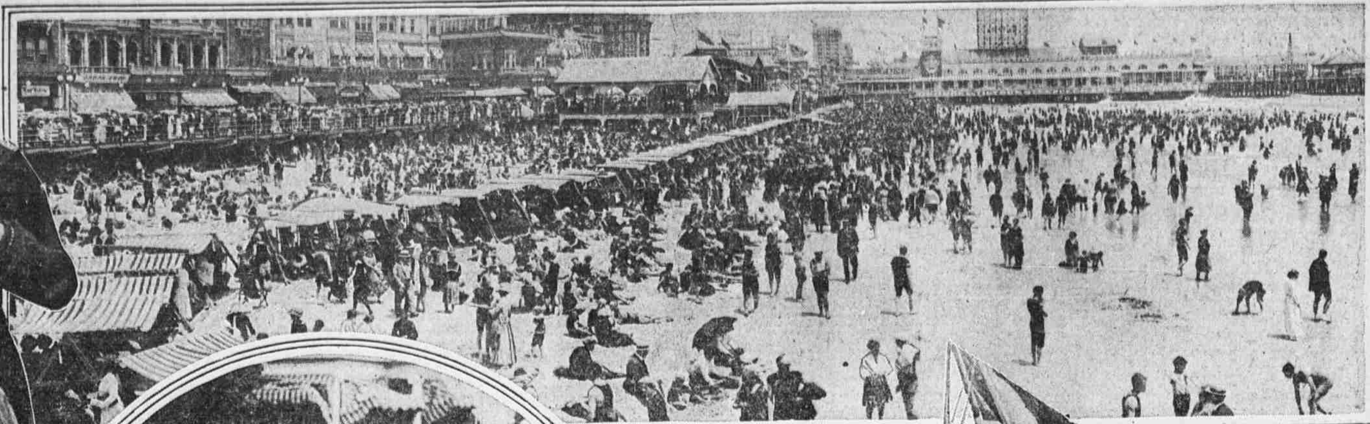
SOME OF ATLANTIC CITY'S HOLIDAY VISITORS