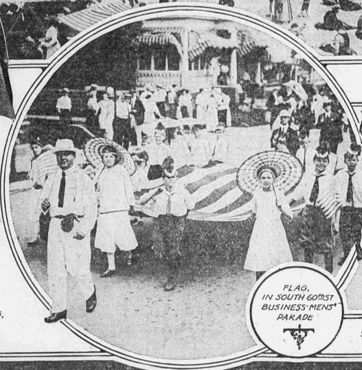
FLAG, IN SOUTH 60 TH BUSINESS-MEN'S PARADE