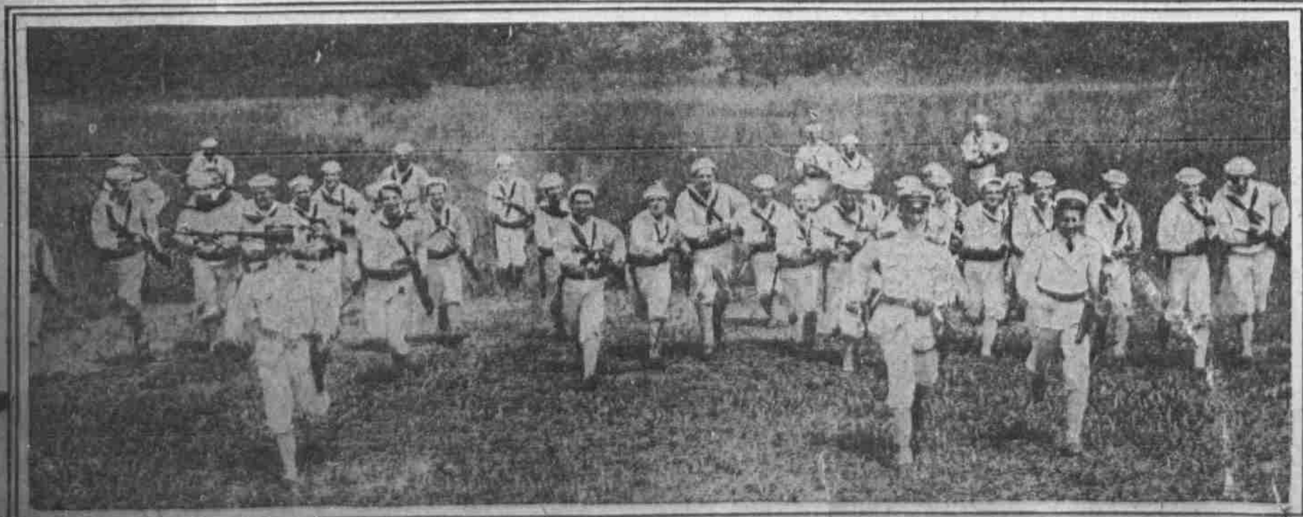
NAVAL MILITIA, IN PRACTICE CHARGE, ON BELMONT ISLAND