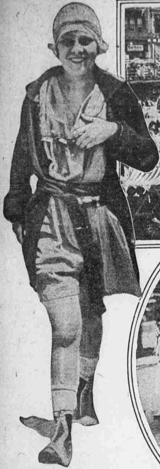
ONE OF THE FAIR BATHERS, AT ATLANTIC CITY

PICTORIAL SIDELIGHTS ON THE CELEBRATION OF THE FOURTH BY CITY AND SHORE