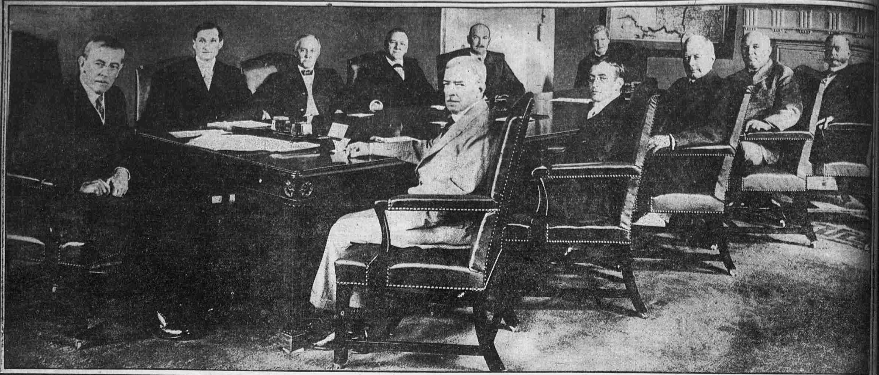
HOW MANY OF THEM CAN YOU NAME?

GRAPHIC NOTES AND COMMENT ON THE VARIED NEWS OF THE DAY AS RECORDED BY THE CAMERA