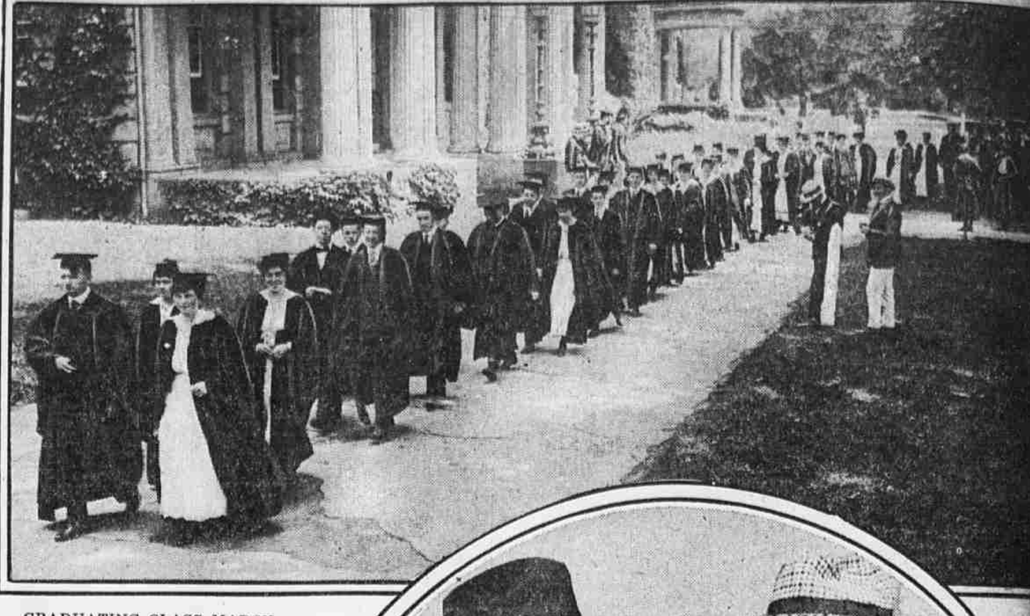
GRADUATING CLASS MARCH-ES IN PROCESSION TO FINAL • EXERCISES AT SWARTH-MORE

There were 83 members of the class, divided into 47 women and 36 men. Only a little more than half the class came from Pennsylvania.