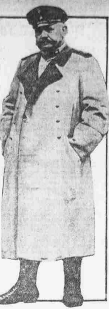
GENERAL VON HINDENBURG Germany's great general who thus far has been unable to make any impression against the Russian advance in Volhynia and Galicia. The latest dispatches report 2000 of von Hindenburg's soldiers captured around Lutsk.