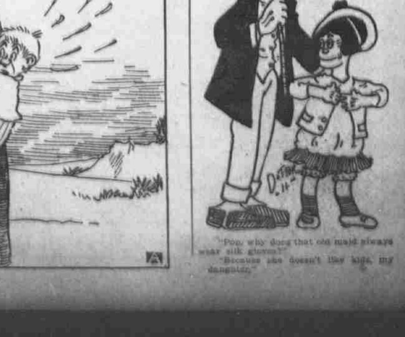
"You say that you made always wear silk gloves."