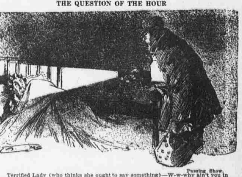
Terrified Lady (who thinks she ought to say something) - W-w-why ain't you in khaki?