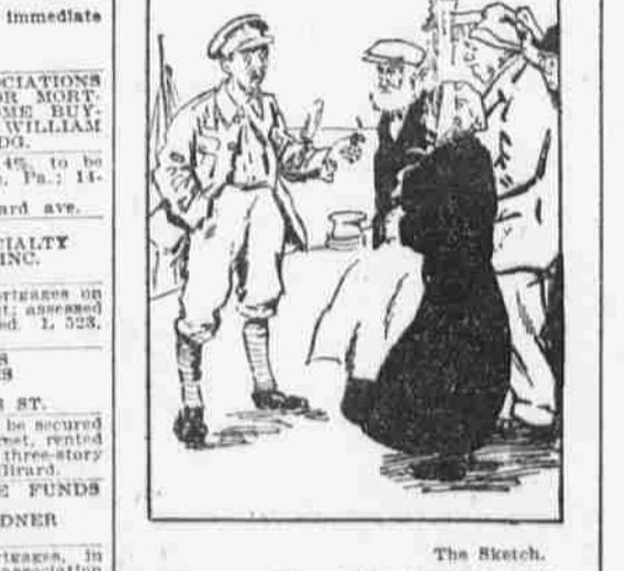
Tommy - They take me from 'ome, an' 'bung me into barracks...