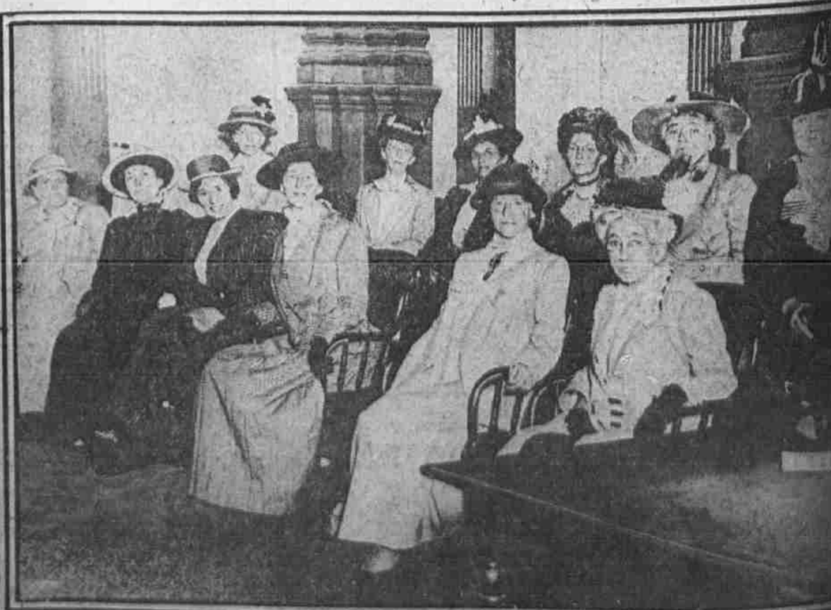
FIRST JURY COMPOSED OF WOMEN TRIES MEXICAN BANDITS They pronounced four men guilty of highway robbery in Superior Court at San Diego, Cal. Legal authorities assert this is the first completely feminine jury ever sitting in a felony case in this country.