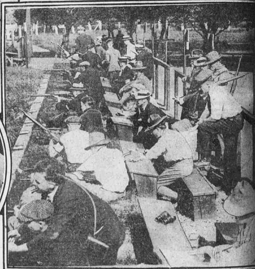
ROOKIES GETTING RIFLE PRACTICE ON THE RANGE AT ESSINGTON Members of the Third Regiment, National Guard, Pennsylvania, are utilizing this method of getting their eyes in trim in preparation for the mimic battle on Belmont Plateau tomorrow.