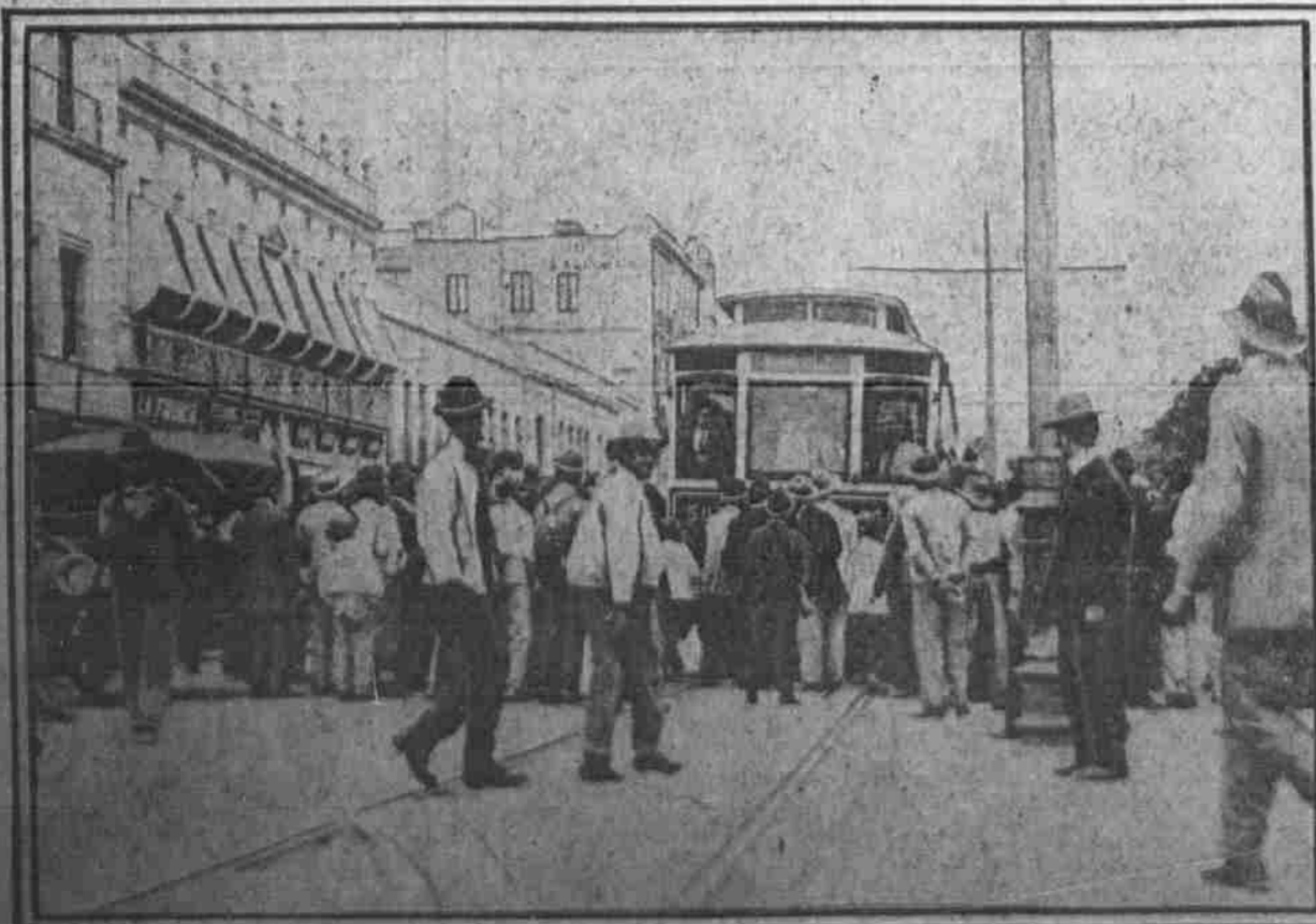
MEXICO CITY HAS A STREET CAR STRIKE TO ADD TO OTHER EXCITEMENTS Showing that the incidents attending "industrial development" are the same in all countries. Here strikers are holding up a car near Alameda Park in the capital.