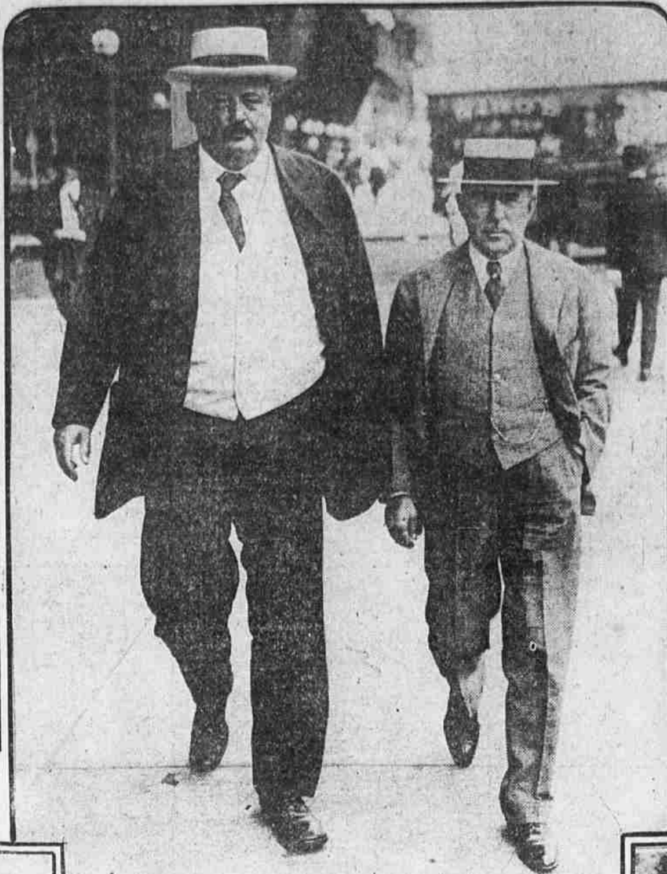
NOTHING TWIN-LIKE ABOUT PENNSYLVANIA'S SENATORS When Mr. Penrose and Mr. Oliver are seen walking together it is never difficult to say which is which, even from a great distance.