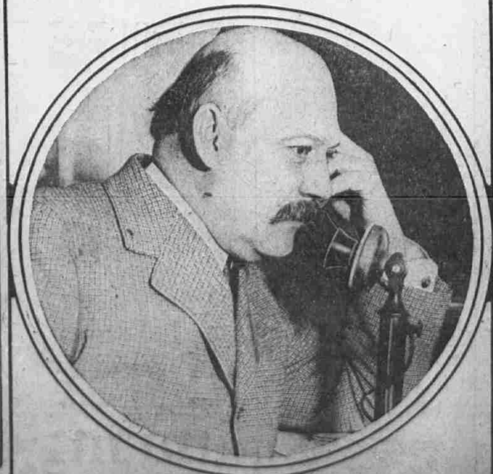
MASSACHUSETTS' FAVORITE "FAVORITE SON" Senator John W. Weeks is on the field with a force which believes it can put him over, and maybe it can.