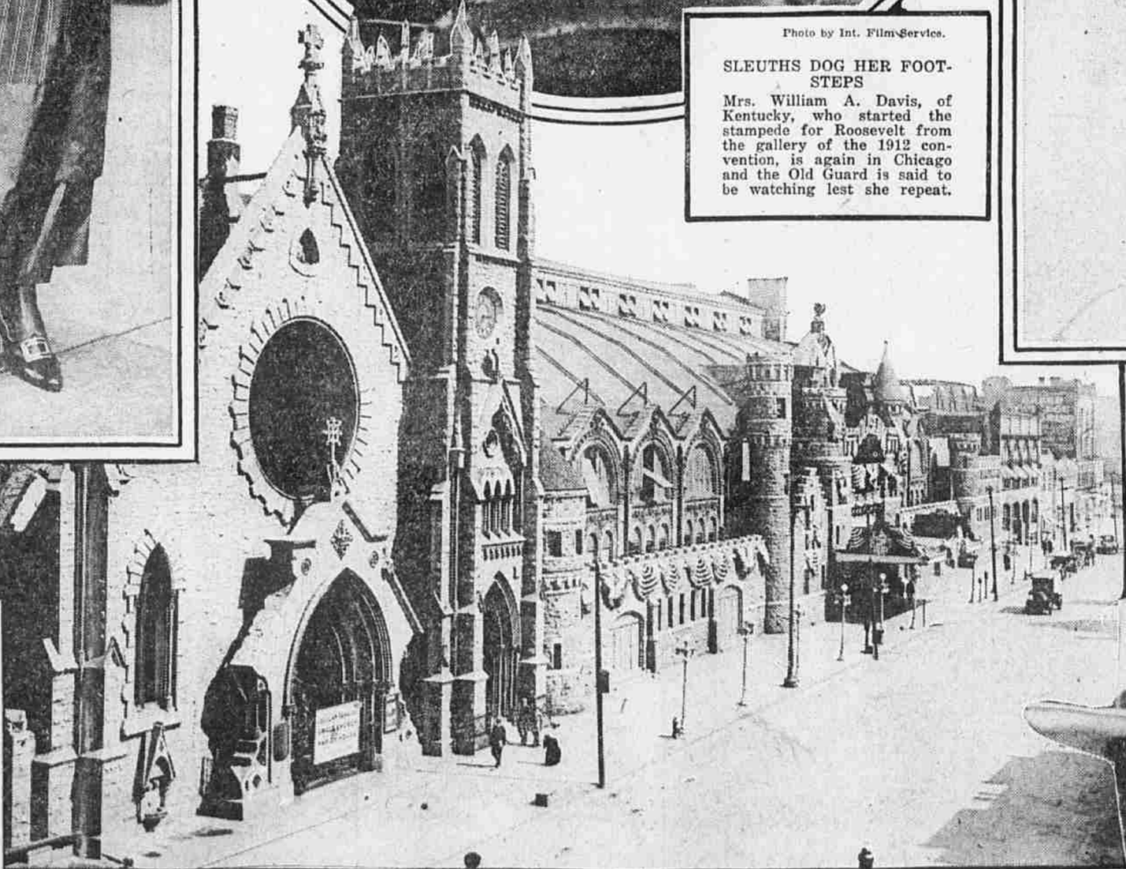
THE COLISEUM Where the proceedings started today. The fact that there is a church adjacent has no significance.