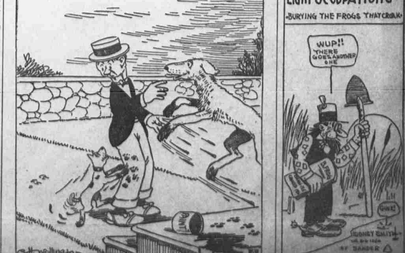
WUP!! THERE GOES ANOTHER ONE.