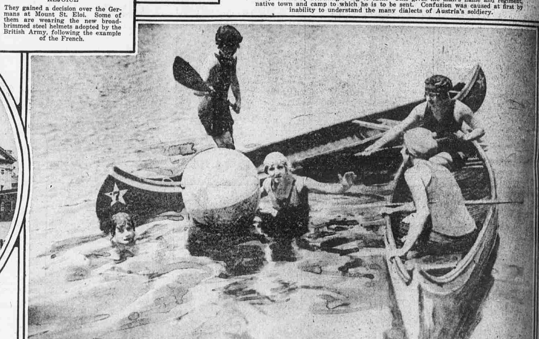
CALIFORNIA ENTHUSIASTIC OVER ITS WOMEN WATER POLOISTS Here is chronicled a block play in the semifinals played at Venice, Cal. The winning team will later go to San Diego to compete for the national championship. All the players are young women.