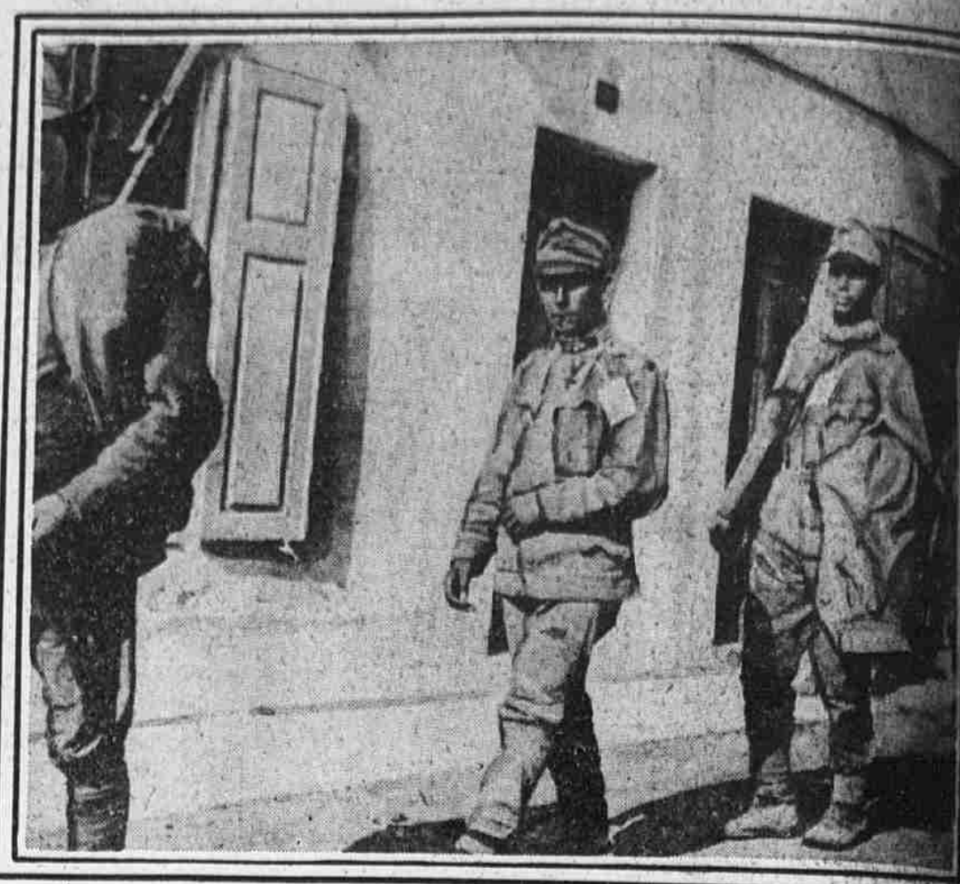
AUSTRIAN PRISONERS ARE TAGGED AS THEY COME IN Taking a leaf from Germany's efficiency book, Italy has solved the problem of handling her prisoners by attaching a tag to each. This gives the man's name and regiment, native town and camp to which he is to be sent. Confusion was caused at first by inability to understand the many dialects of Austria's soldiery.