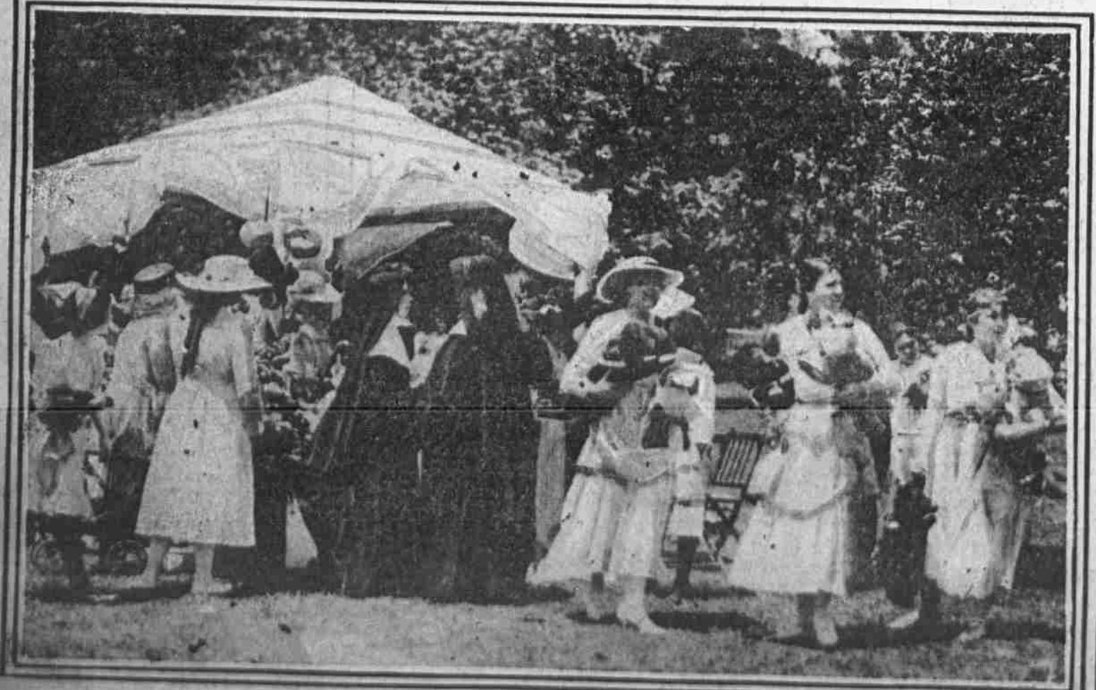
BESIDE ONE OF THE BUSY BOOTHS AT MERION'S FETE CHAMPETRE Everything from jelly to books is on sale at the fair being held on the grounds of Merion convent for the benefit of the Mater Misericordiae Hospital.