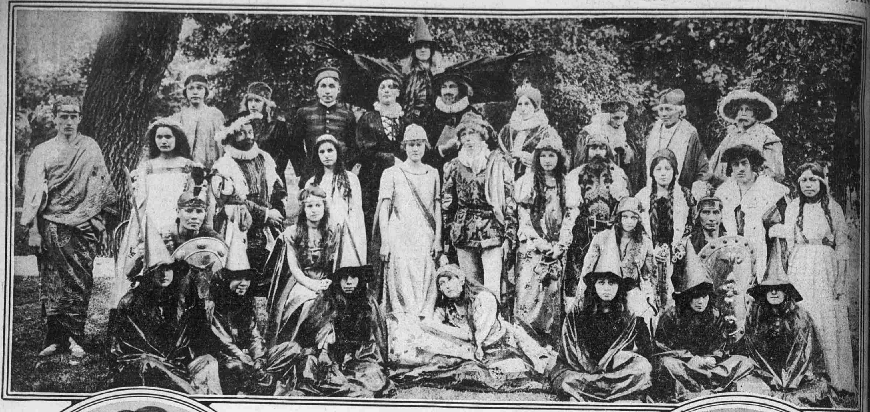
ALL-INDIAN CAST PLAYS SHAKESPEARE IN OBSERVANCE OF CENTENARY

SUNDRY SIDELIGHTS ON THE VARIED NEWS OF THE DAY AS RECORDED BY THE CAMERA-MAN