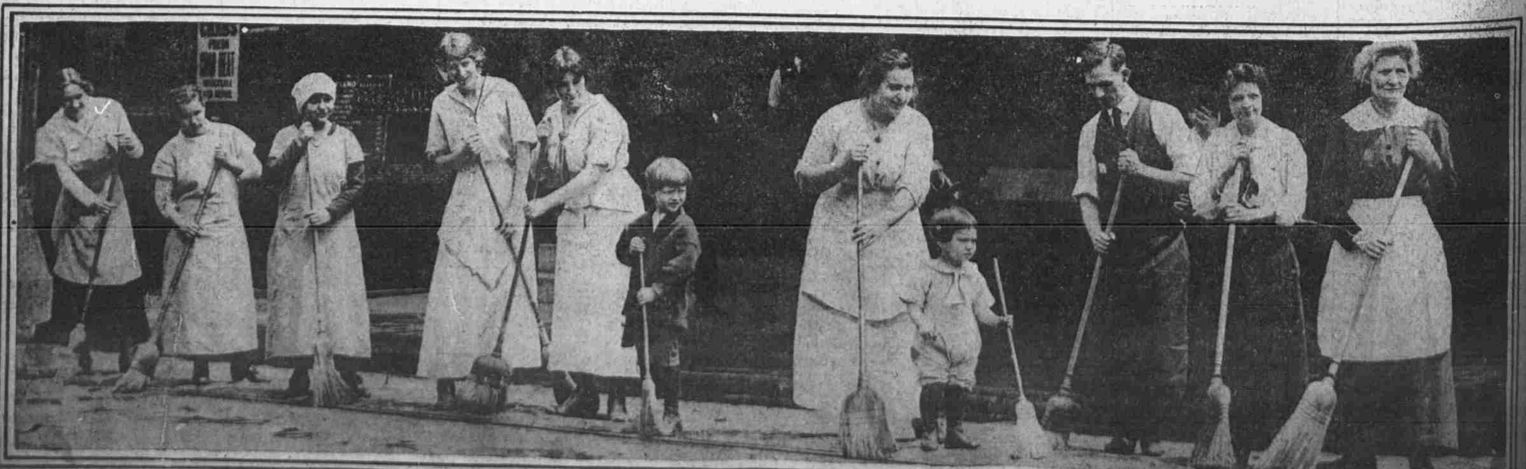
VOLUNTEER CLEANUP-WEEKERS SERVING THEIR CITY AND COMMUNITY BY ASSAILING THE DIRT AND DEBRIS ON GERMANTOWN AVENUE, BETWEEN INDIANA AVENUE AND CLEARFIELD STREET.