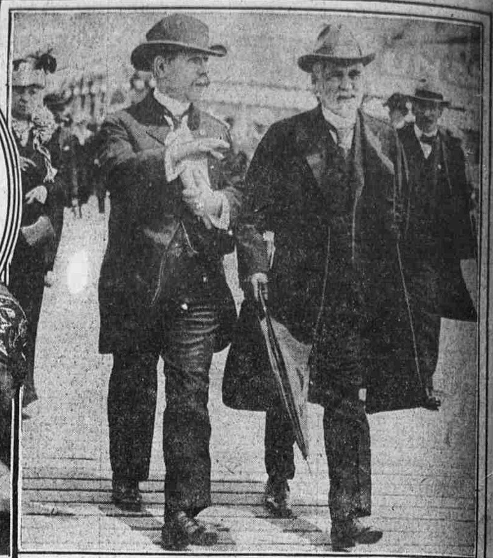
HERE HE IS AGAIN These features belong to an American Colonel more widely known than any other in the world, save perhaps one—in short, this is Colonel W. F. Cody, better described as Buffalo Bill.