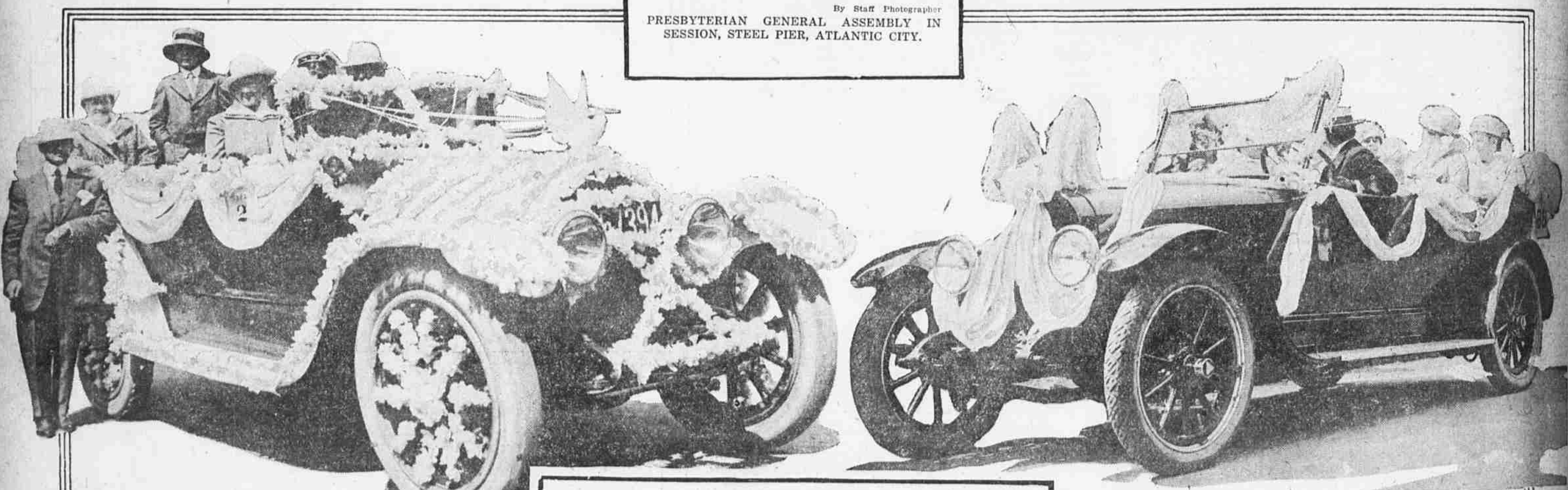
MOTOR FLOATS IN PARADE WHICH OPENED CAMDEN'S INDUSTRIAL EXPOSITION YESTERDAY