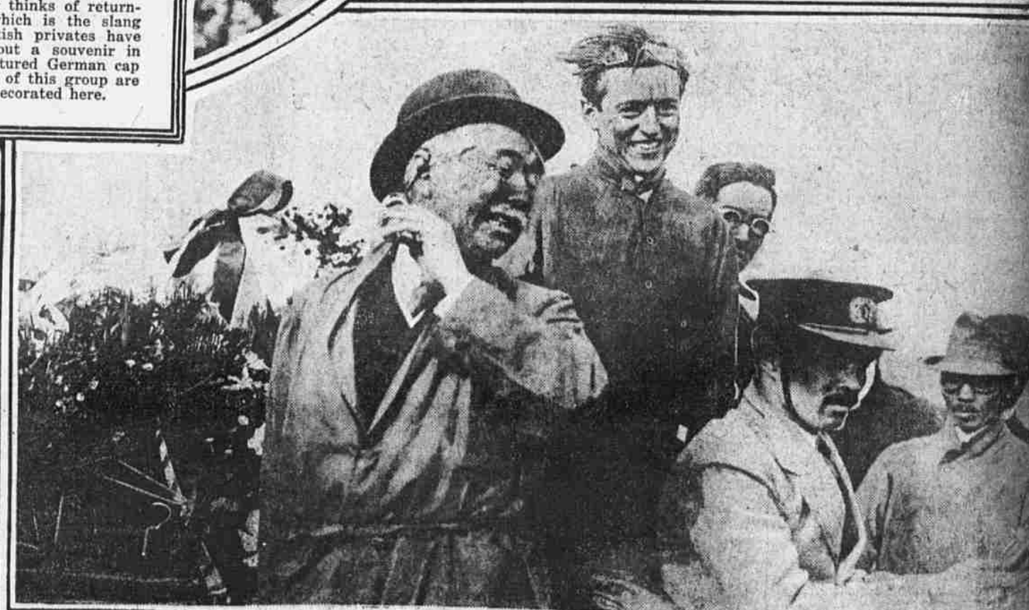
YOUNG AMERICAN AVIATOR GETS MIXED RECEPTION FROM TEMPERAMENTAL JAPANESE When "Art" Smith began looping the loop for Tokio crowds they overwhelmed him with plaudits, as in this picture, where the gentleman in the foreground is lauding him, but when he was late getting started at Osaka the crowd stoned him and wrecked his shed.