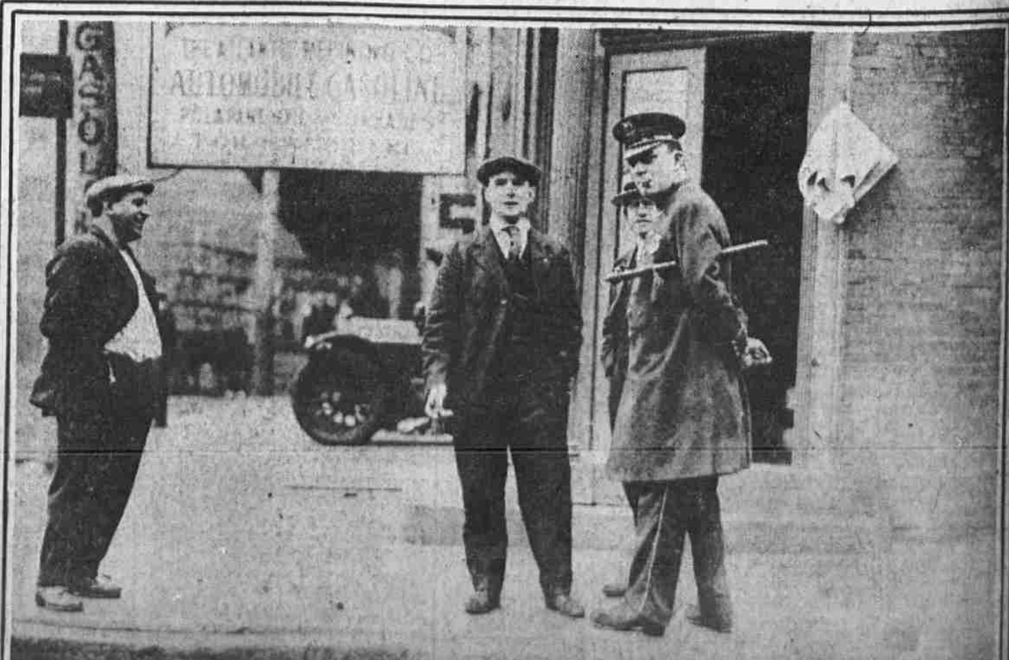
POLICEMAN IN FOURTH WARD VIOLATES LAW HE IS THERE TO ENFORCE The 1913 act says: "No police officer in commission, whether in uniform or in citizen's clothes, shall be within 100 FEET of a polling place during the conduct of a primary unless in the exercise of his privilege of voting or for the purpose of serving warrants or in case of disturbance of the peace." This picture was taken yesterday at Front and South streets.