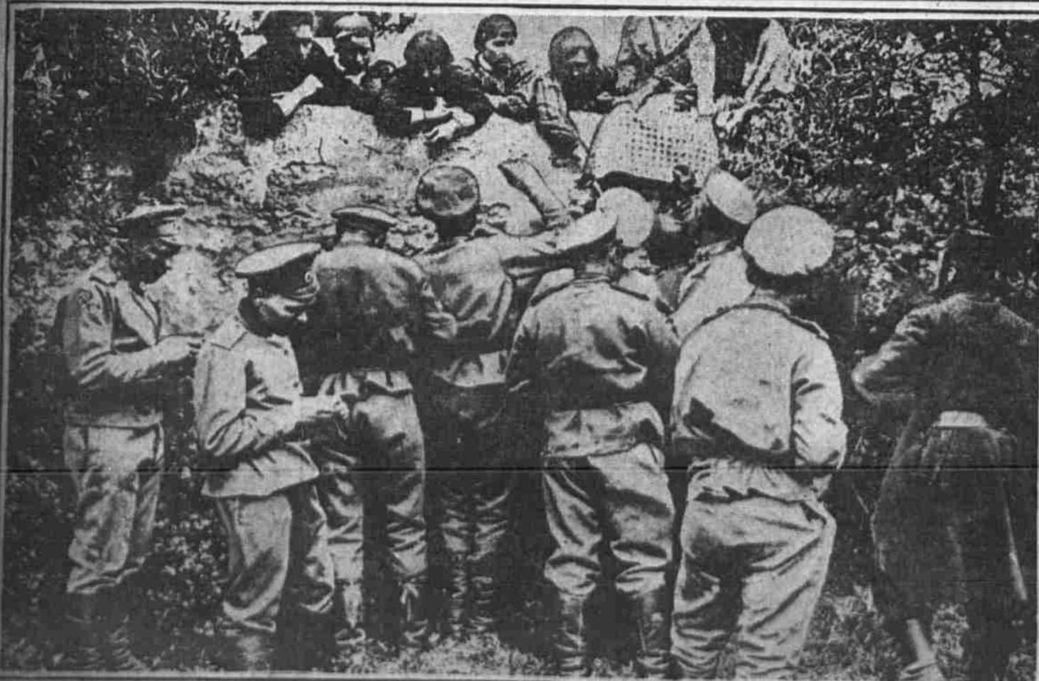
WOMEN OF FRANCE SHOWER ATTENTIONS ON NEWLY ARRIVED RUSSIANS The Slav troops, four contingents of which are now in camp in the south of France getting themselves acclimated, are rescuing hordes to the women and children of the republic, who are seen here loading the new arrivals with gifts. They are powerful, strongly built fellows, as this photograph reveals.