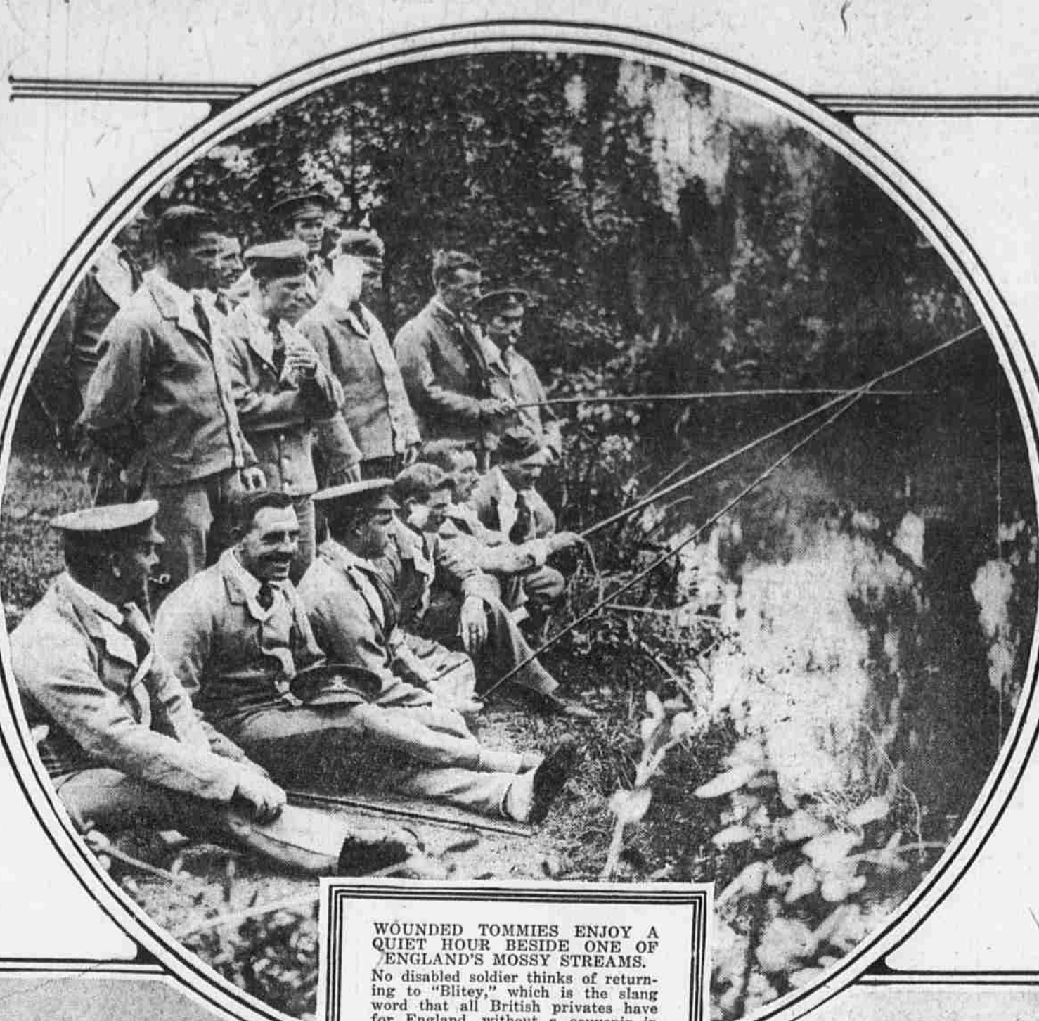
WOUNDED TOMMIES ENJOY A QUIET HOUR BESIDE ONE OF ENGLAND'S MOSSY STREAMS. No disabled soldier thinks of returning to "Blitzey" which is the slang word that all British privates have for England, without a souvenir in the shape of a captured German cap or helmet, and two of this group are seen to be so decorated here.