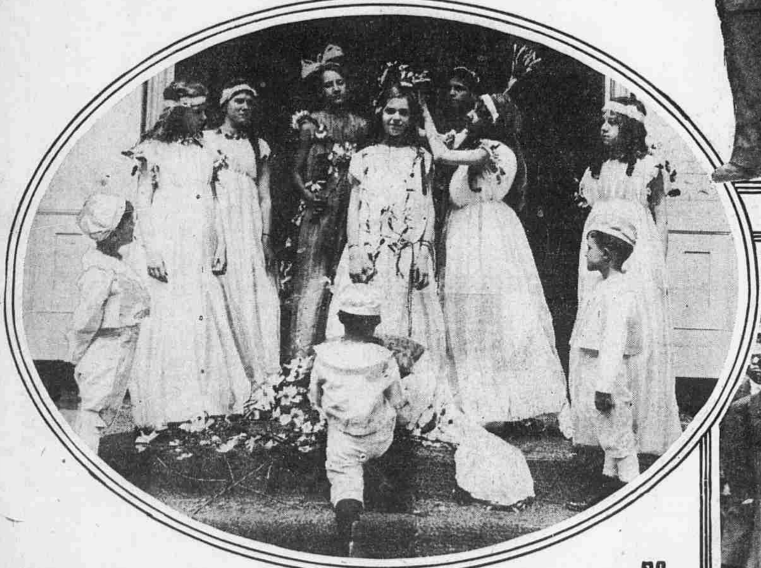
CHILDREN OF FRIENDS' GIRARD AVENUE SCHOOL CROWN QUEEN OF THE MAY Almost all the costumes seen here were designed by the young players themselves. The festival was held in front of the school building at 17th and Girard avenue. Pupils from the kindergarten, four and five years old, took part in the festival.