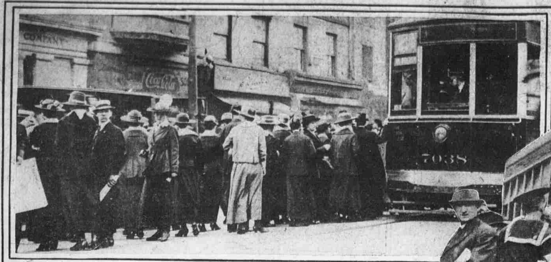
"TAKE THE CAR BEHIND"—UNANSWERABLE ARGUMENTS FOR THE TRANSIT LOAN One reason why the transit loan should pass—long lines of tired shoppers waiting for cars on Market street. The picture on the right shows a crowd struggling around the entrance of a car already carrying the "full" sign. It won't hold another human being, though it has six blocks to go before leaving the main thoroughfare, on which passengers wait at every corner.

GRAPHIC NOTES AND COMMENT ON THE VARIED NEWS OF THE DAY AS RECORDED BY THE CAMERA