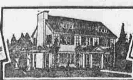
COLONIAL, $8950 Lot, 60x140.

3 Trolleys, 5-Cent Fare | 72 Trains Daily Out Old York Road 9 1/2 Cents