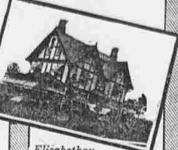
Elizabethan English SOLD