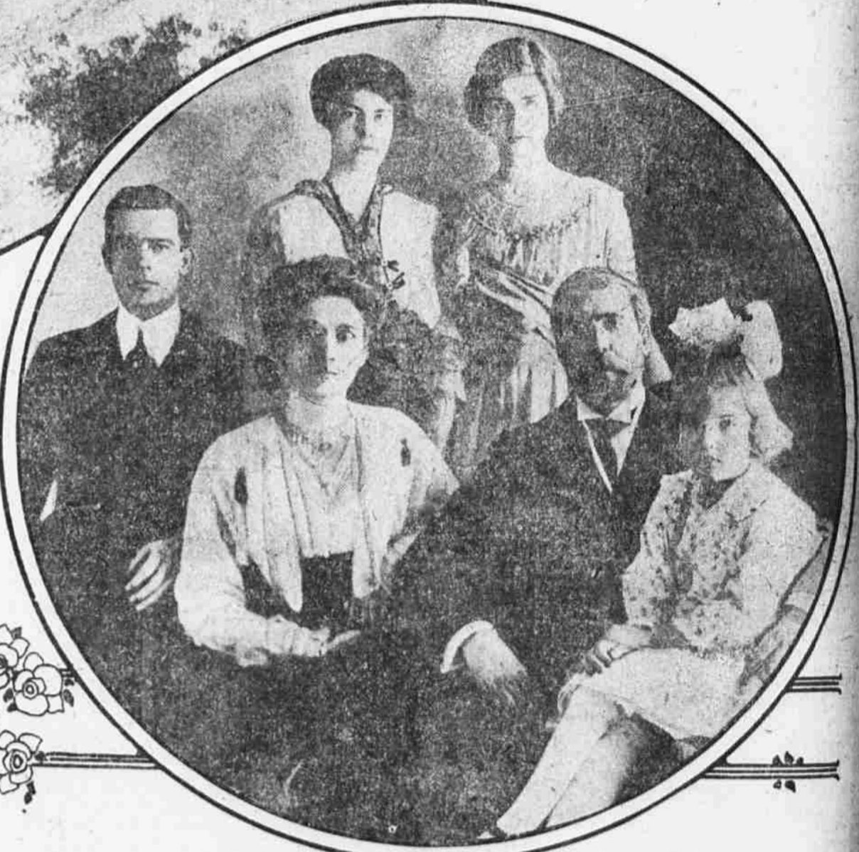
WILL THIS BE THE NEXT WHITE HOUSE FAMILY? Supreme Court Justice Charles E. Hughes, Mrs. Hughes and their four alert-looking children; from a new photograph. The Justice is said to attribute much of his success to his intellectual wife.