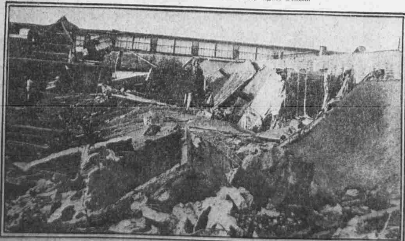
EXPLOSION WRECKS PLANT NEAR TRENTON, N. J., KILLING THREE PERSONS The enormous power of the blast is revealed by the broken pieces of the heavy concrete roof over the drying room of the Chandler Oilcloth Works at Yardville. Pieces of wreckage were thrown 200 feet. Six workmen were injured.