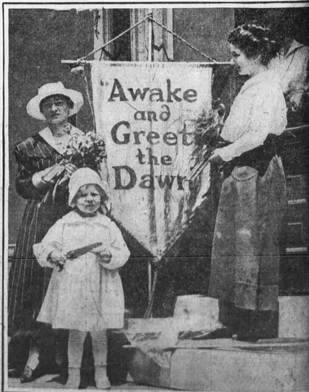
SUFFRAGISTS SEND MAY DAY BOUQUETS TO POSSIBLE FRIENDS Delegates to the National conventions which meet this summer got neat little bouquets yesterday, to which were attached miniature suffrage "planks." This banner went along in the automobiles.