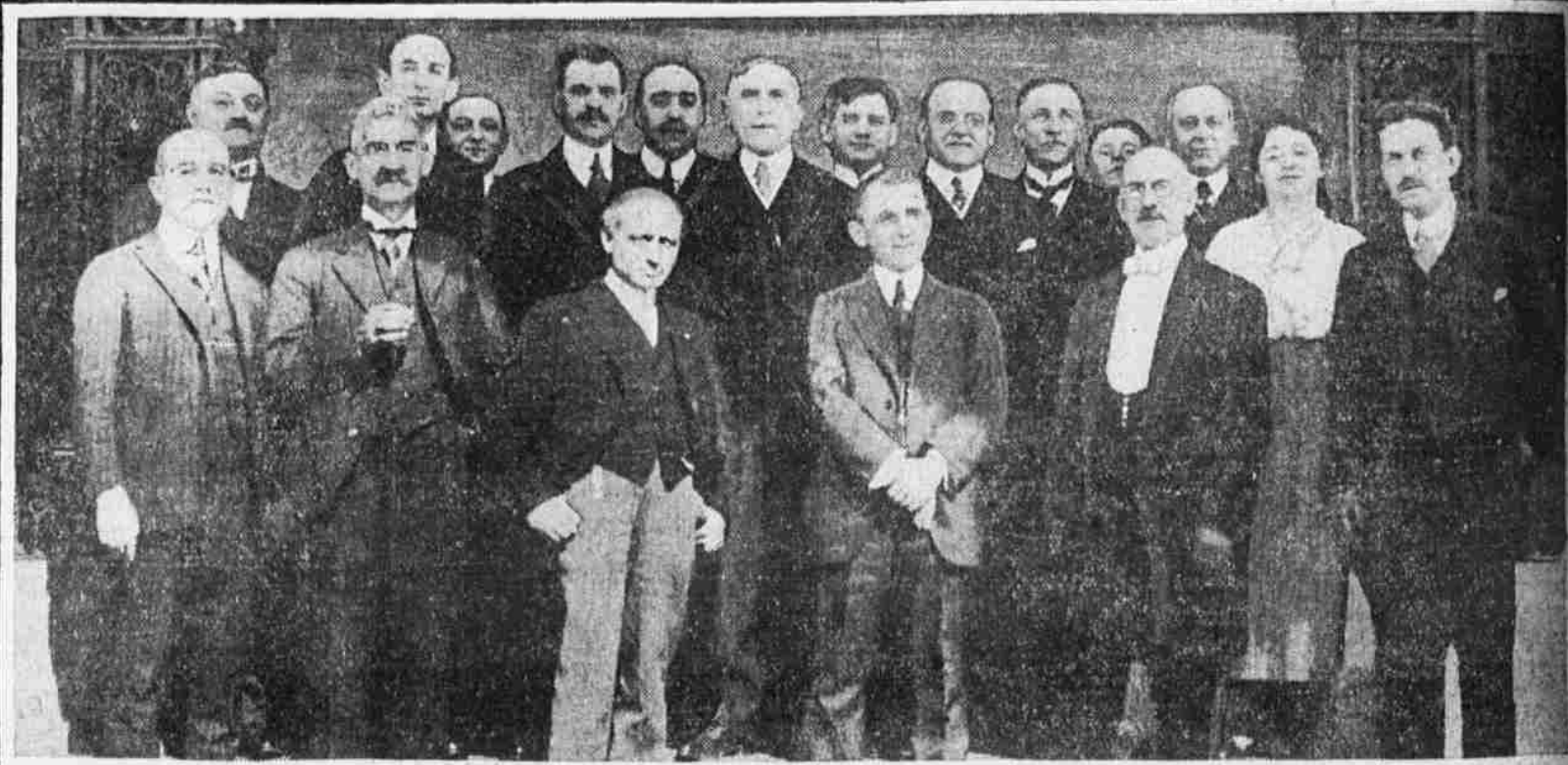
RAISING A FUND OF $50,000 FOR THE B'NAI B'RITH ORPHANAGE AT ERIE