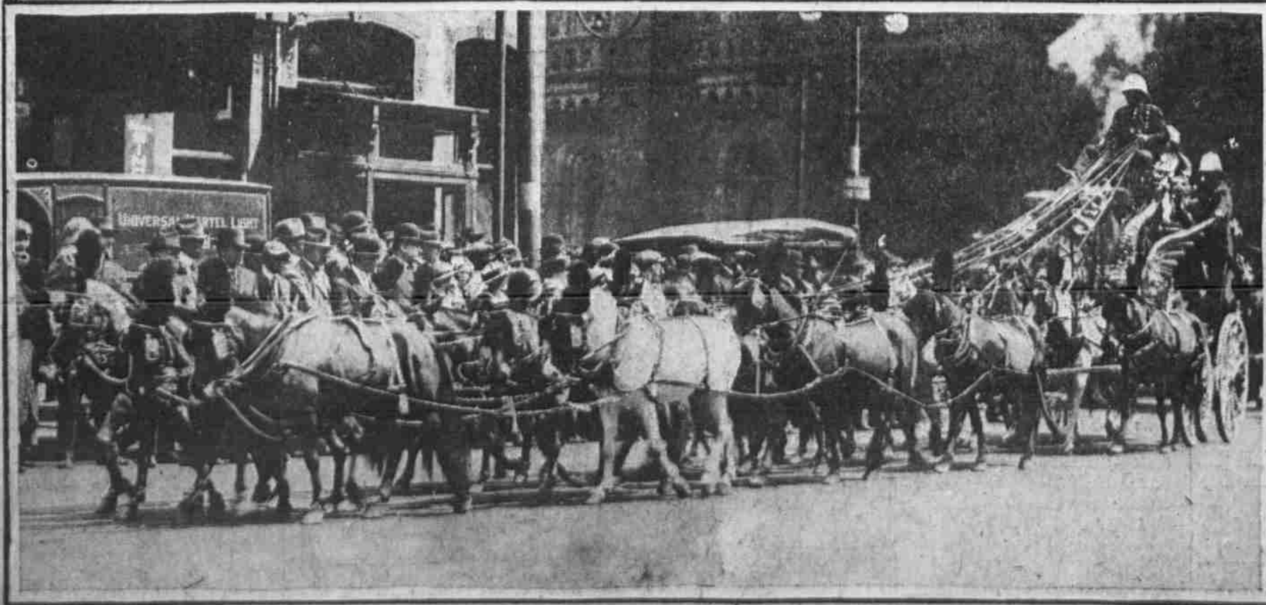
A THRILLING WEEK FOR ALL THE CITY'S CHILDREN BEGAN YESTERDAY

This is part of the pony contingent belonging to Museum & Bailey's Circus which will be here all the rest of the week to the delight of North Philadelphia.