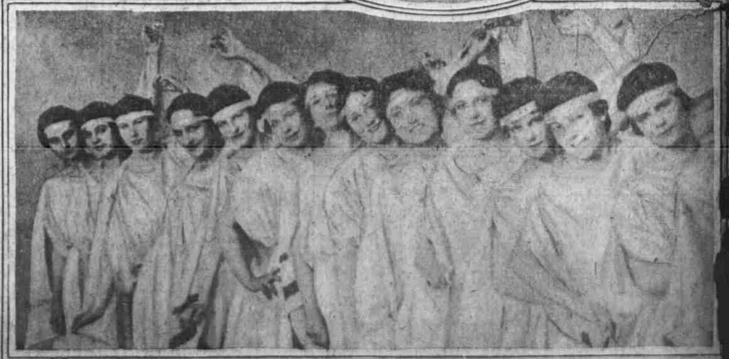
STUDENTS OF PHILADELPHIA INSTITUTIONS GIVE EXCELLENTLY DRILLED PERFORMANCES OF SHAKESPEAREAN FANTASY AND GREEK PLAY