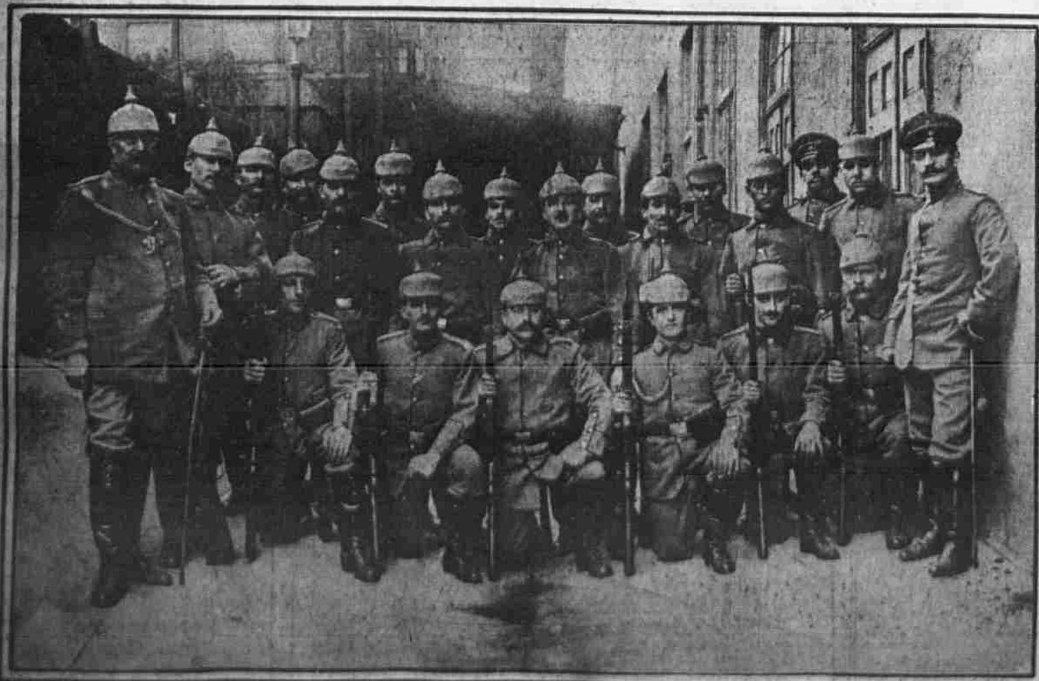
UXTREE—GERMAN SOLDIERS OCCUPY BUILDING IN HEART OF CITY

Four of these speedy craft are being built for the Volunteer Patrol Squadron, of Lynn, Mass. They measure 40 feet over all, with eight-foot eight-inch beam and three-foot draft. Its engines furnish 135 horsepower. They will carry wireless.