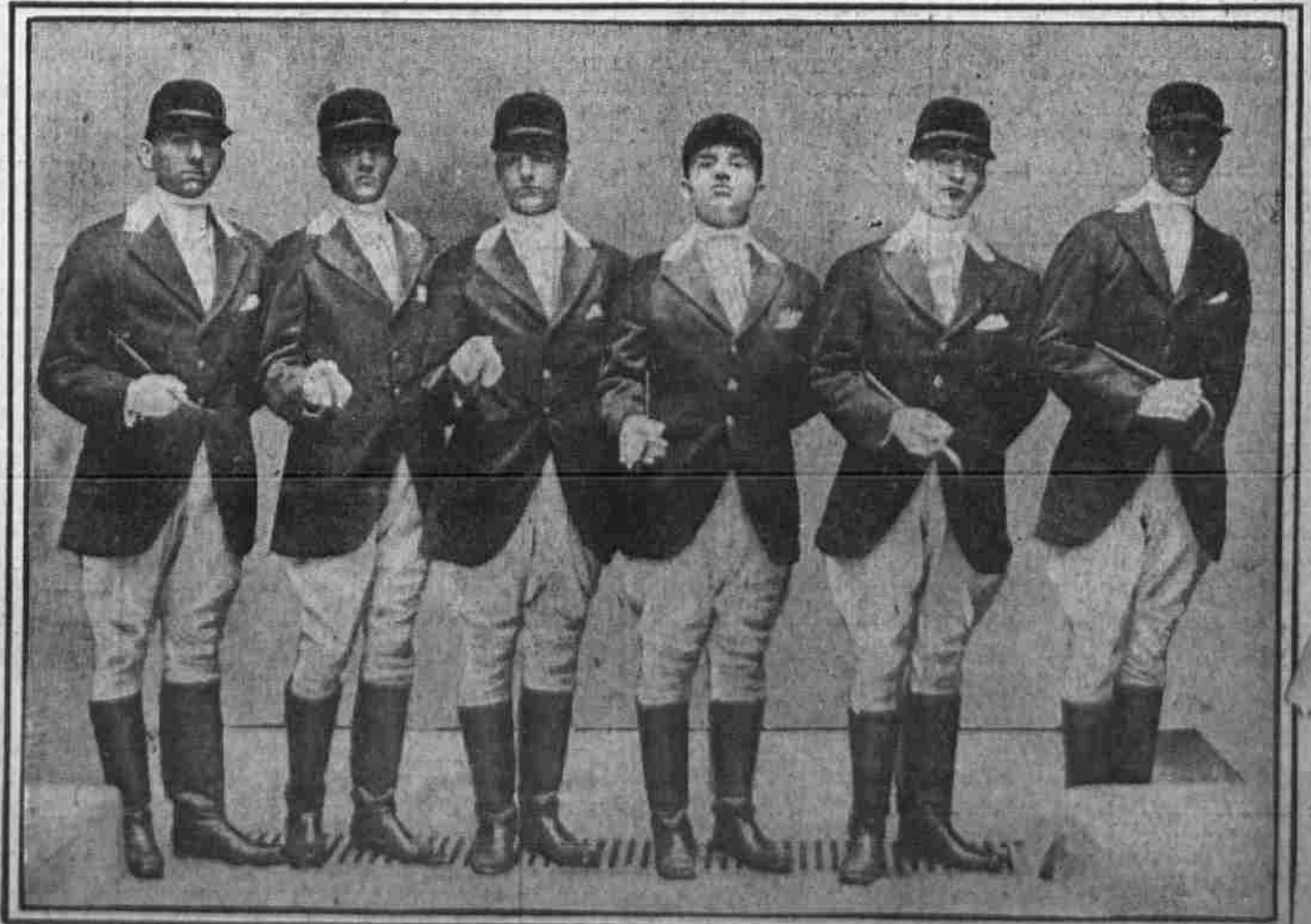
HUNTSMEN'S CHORUS IN THE NEW MASK AND WIG SHOW

They are not reinforcements for the Verdun line, but occupants of the model trench at the Red Cross Bazaar for the Central Forces of Europe, now open at Convention Hall.