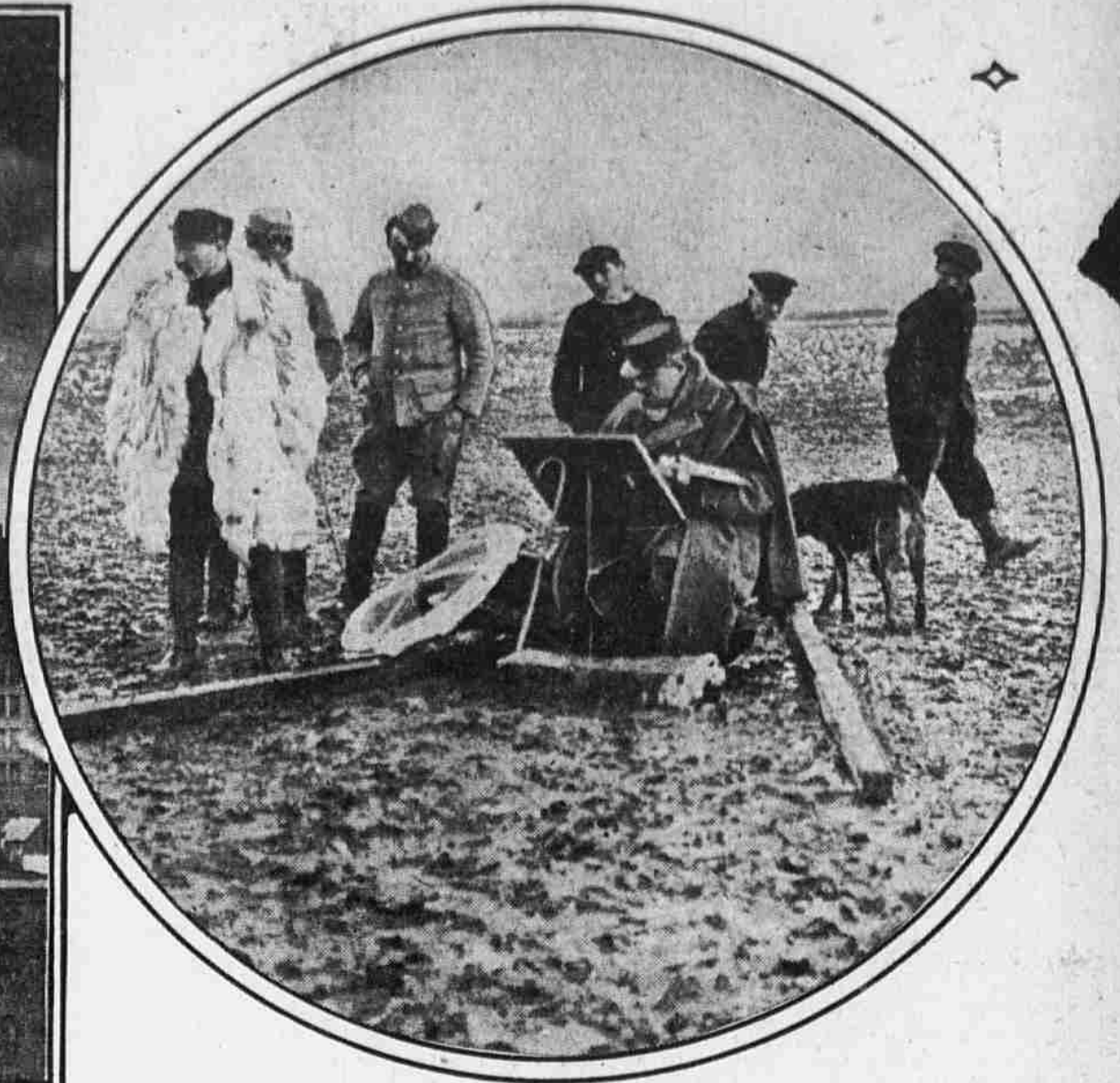
SOLDIER ARTIST GETS "LOCAL COLOR" ON BATTLEFIELD

A timely study of the city's skyline and the heavens as they look at this time of the year, by a staff photographer