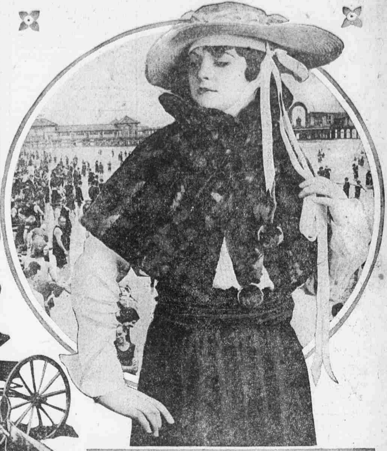
FUR CAPES WILL BE IN THE MODE THIS SPRING AND SUMMER This concoction, with fur tie and balls, is made of moleskin lined with rose and gray striped silk.