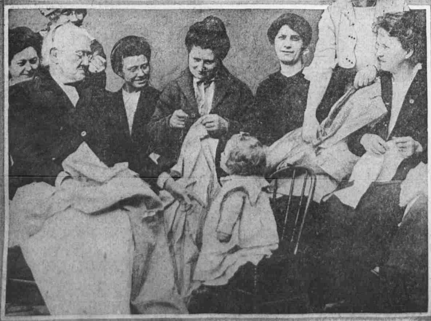
CLASS OF SOUTH PHILADELPHIA MOTHERS WHO ARE LEARNING HOW TO PLAY Children and their mothers both go to school together at the Moore Street Mission, where 300 or more of them take lessons from half a dozen young women.