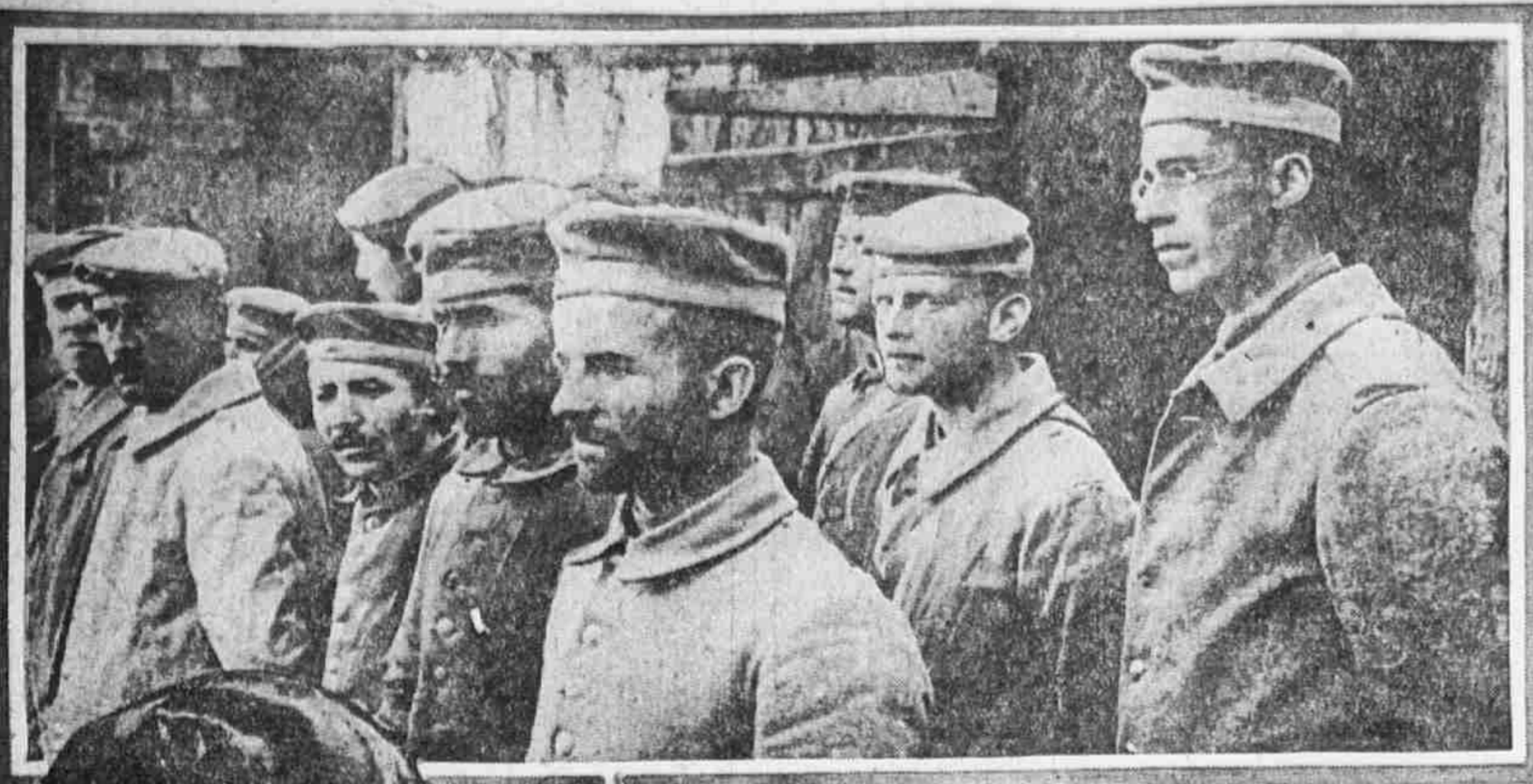
GERMANS CAPTURED AT VERDUN They range all the way from the "high-brow" in spectacles, who before the war was probably a school teacher, to the plain, ordinary "rough neck."

GRAPHIC NOTES AND COMMENT ON THE VARIED NEWS OF THE DAY AS RECORDED BY THE CAMERA