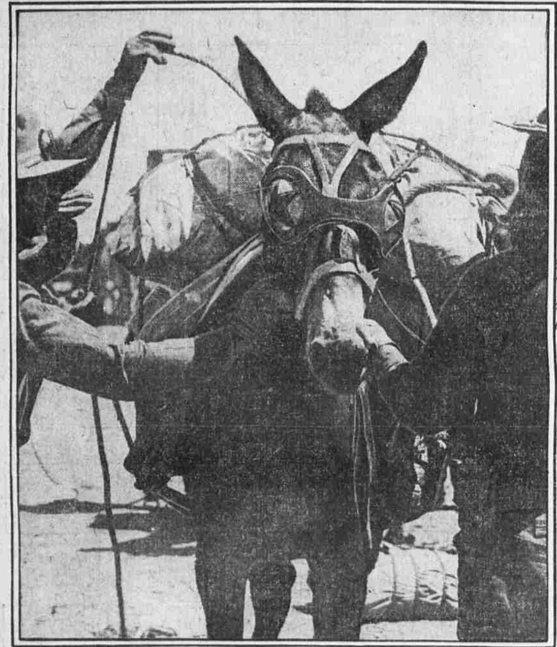
ARMY MULES IN MEXICO FOLLOW THE LATEST STYLES IN GOGGLES Four hundred miles of alkali dust and hot sun are trying to the eyes of even a military "pestle-tail," so blinkers have been dealt out generously to animals as well as men. The fashion in goggles was first started by the gas attacks in the European war zones.