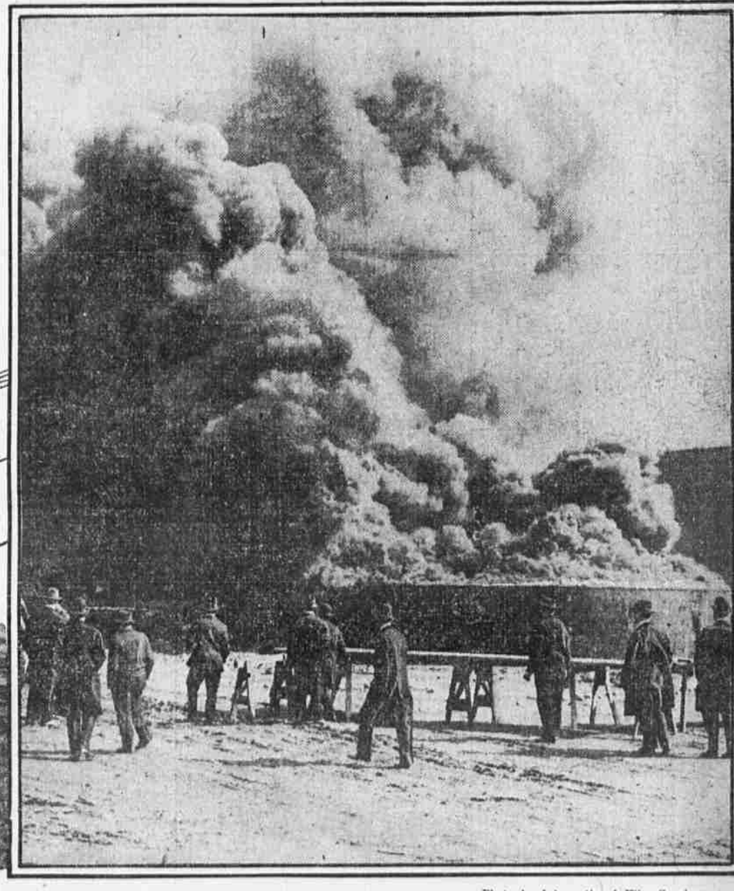
BIG STANDARD OIL TANK SET AFIRE IN TEST OF NEW EXTINGUISHER To give a trial to a new chemical preparation, which is declared to be powerful enough to smother the fiercest blaze, this tank was filled with 11,600 gallons of oil and permitted to become thoroughly ignited. It was extinguished in one and one-half minutes.