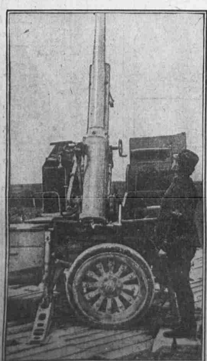
GUN THAT BEOUGHT DOWN ZEPPELIN The gunder who fired the fatal shot from this new truck-mounted anti-aircraft rifle received