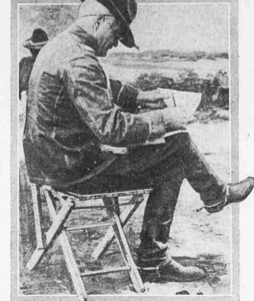
This photograph, taken "somewhere in Mexico," is a characteristic portrait of the man delegated with the simple mission of "getting Villa."

The fact that more than 700 unrounded French prisoners were taken and many more than that were killed or wounded in