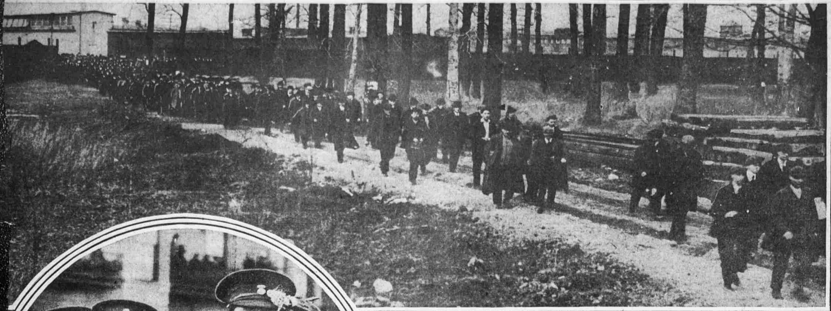
ARMY OF MUNITION WORKERS OF ALL AGES WHICH AT THE CLOSING HOUR DAILY STREAMS FROM THE GATES OF THE HUGE PLANT OF THE REMINGTON ARMS COMPANY AT EDDYSTONE This remarkable sight may be witnessed every weekday afternoon between 5:30 and 6 o'clock. The crowds of workmen so fill up Chester pike and 9th street in the direction of Chester that all traffic in the opposite direction is virtually blocked till the myriad employes have scattered. They come from every State in the Union.

VARIETY OF PICTORIAL SIDELIGHTS ON THE LATEST NEWS OF THE DAY FROM MANY SOURCES