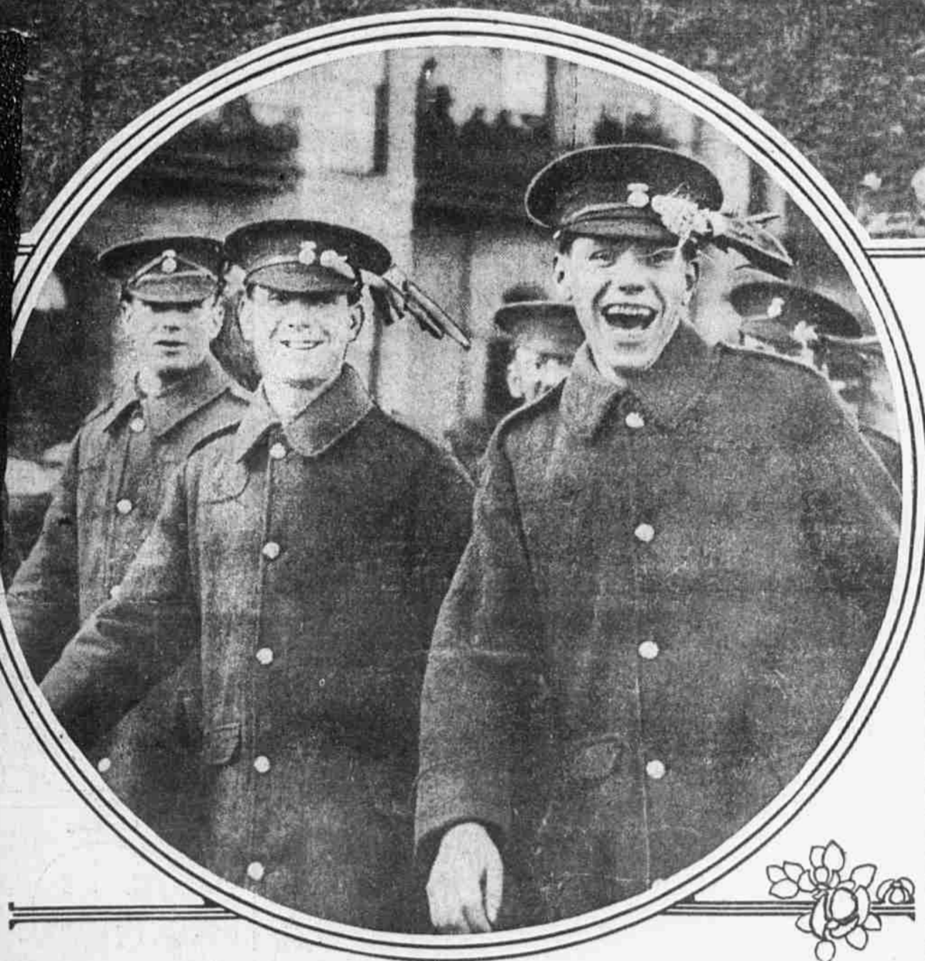
BRITAIN'S WELSH SOLDIERS CELEBRATE ST. DAVID'S DAY They are wearing leeks on their hats, this being the national symbol on Wales' great day. St. David's name is borne, be it recalled, by one of Philadelphia's best-known Main Line suburbs.