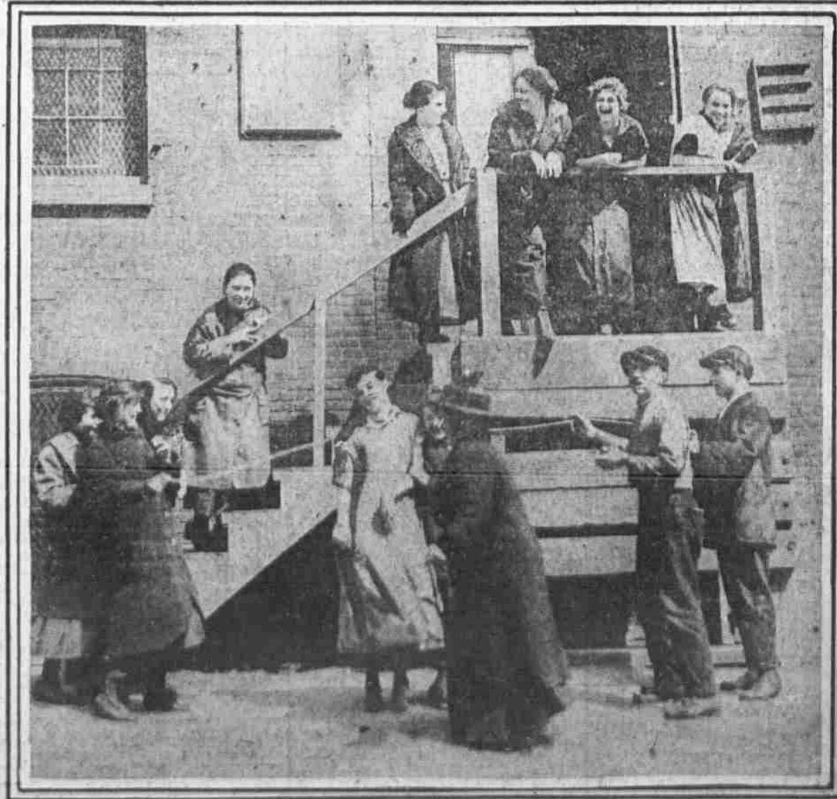
NOON IS THE FAVORITE HOUR IN THE HEART OF THE MILLS OF KENSINGTON A feature of life in Philadelphia's big manufacturing district are the noon-hour gatherings that cluster around factory doorways and stairs, where relaxation is the word till the whistle blows again.