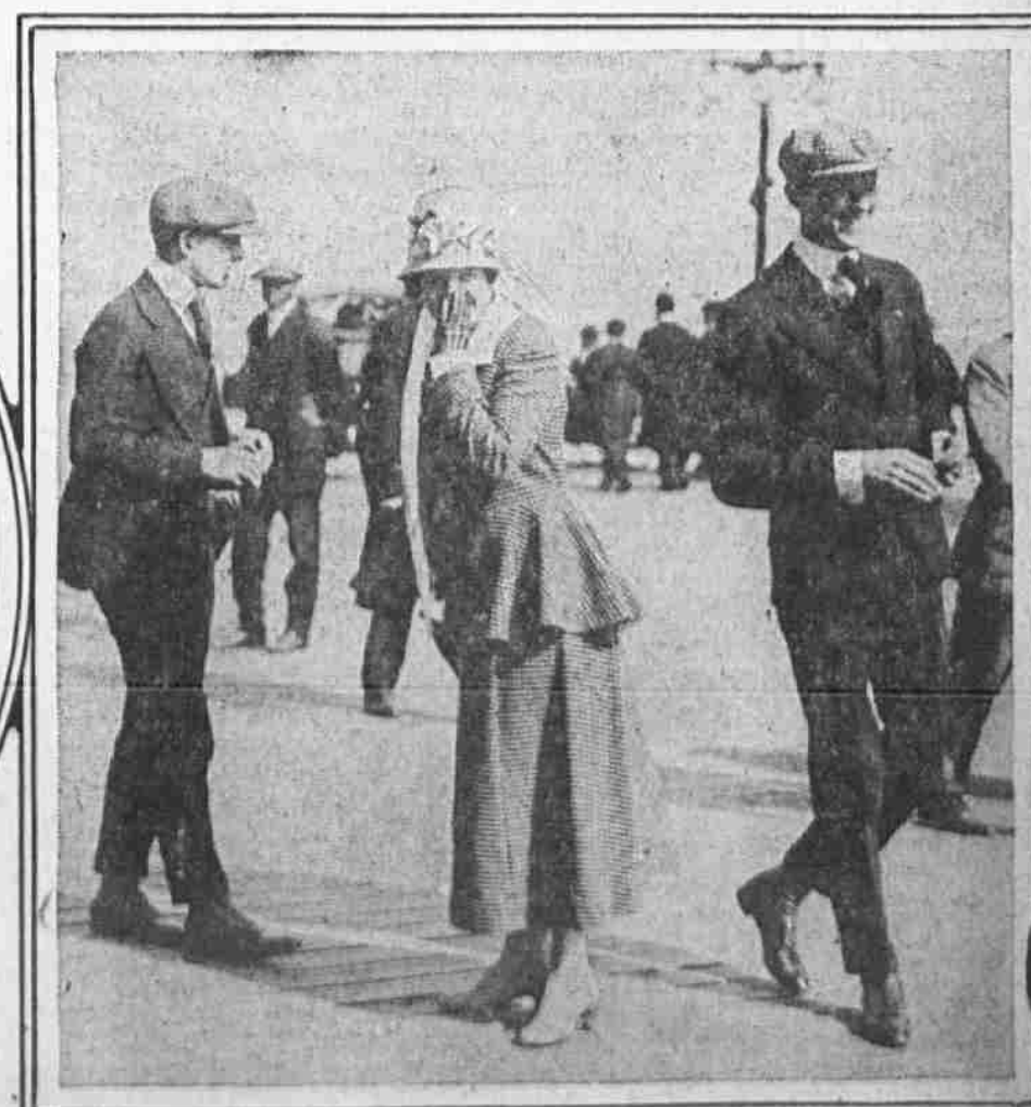
A GLIMPSE OF A BOARDWALK FLIRTATION That the open season for this favorite outdoor sport is now on at Atlantic City is evidenced by this snapshot by a staff photographer. Note the spring bonnet, tog.