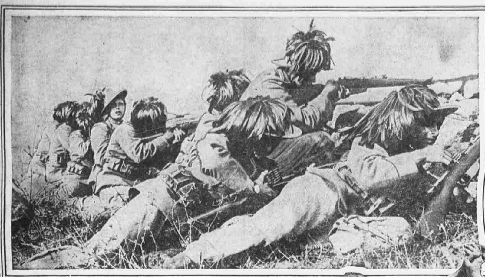
ITALY TO ASSIST ALLIES BY MORE VIGOROUS OFFENSIVE The picture shows members of the Bersaglieri, Italy's crack troops, on the firing line. The appointment of a new War Minister is believed to foreshadow a fiercer assault on the Austrian lines.