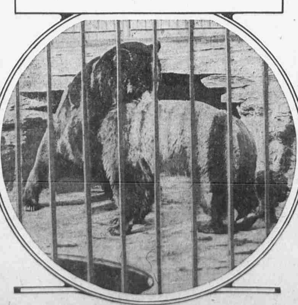
PARK GRIZZLIES IN A WRESTLING BOUT These two veterans of the Fairmount Park Zoo were caught by the photographer as they started a friendly scuffle, caused, no doubt, by the spring air.