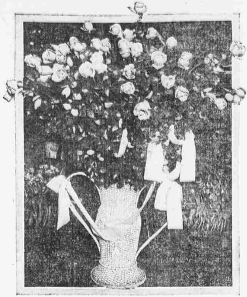
President Wilson's Granddaughter Receives $500 "Flowergram," the Costliest Ever, Calling for Blooms That Won Blue Ribbon at Show

100 ROSES, WORTH $5 EACH, ARE SENT TO THE NEW SAYRE BABY, 100 HOURS OLD