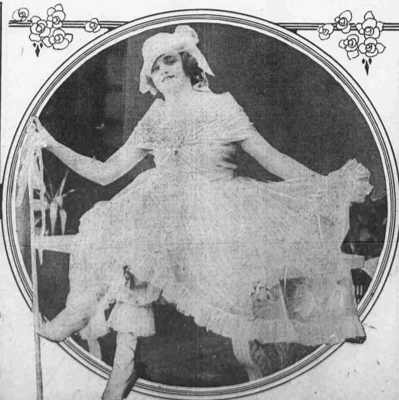
Bridesmaid's gown of white tulle, with lace pantalettes and staff of white enamel.