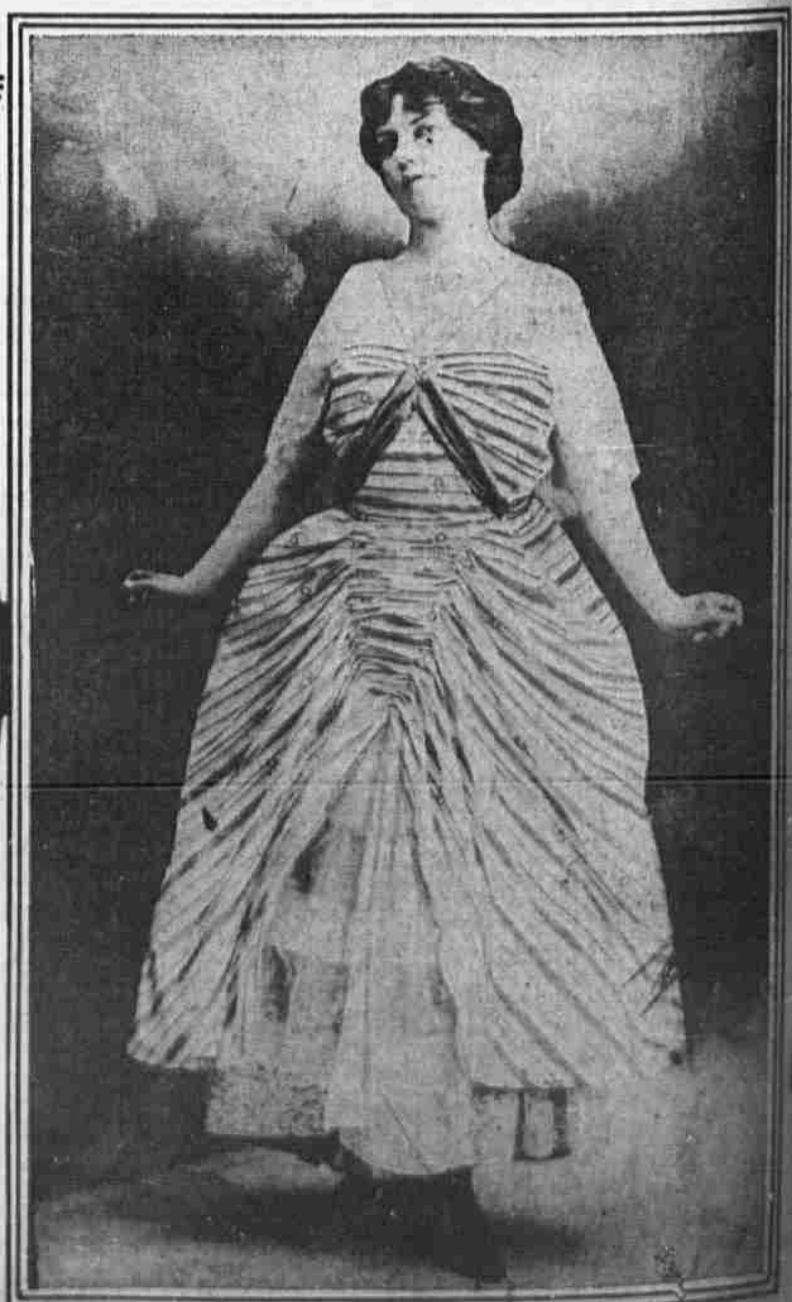
Evening gown of pussy willow taffeta, over lace and striped dress skirt.

LIVING MODELS EXHIBIT TO AUDIENCE IN BELLEVUE-STRATFORD SARTORIAL MODES OF THE SEASON AT WALNUT STREET BUSINESS ASSOCIATION'S FASHION SHOW