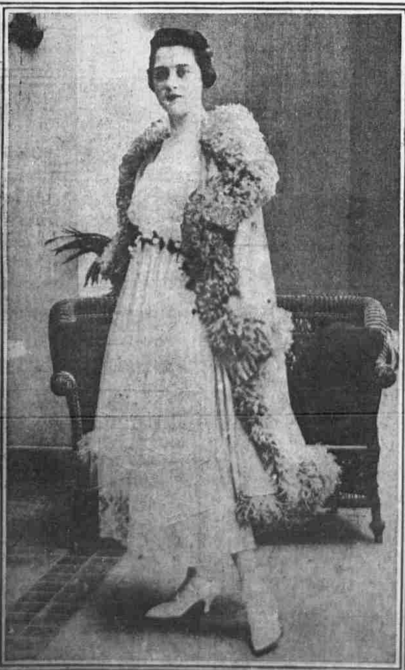
Young girl's gown of tulle and lace, with garniture of French flowers.